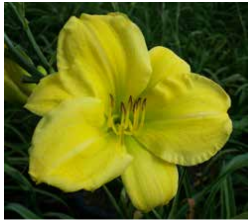
Coastal: Old Adage