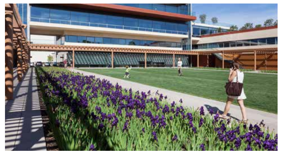
Rooftop Gardens – Shallow roots and tolerance of wide temperature swings make bearded irises well-suited to rooftop planting. Swollen crowns (rhizomes) store months of water and nutrients.