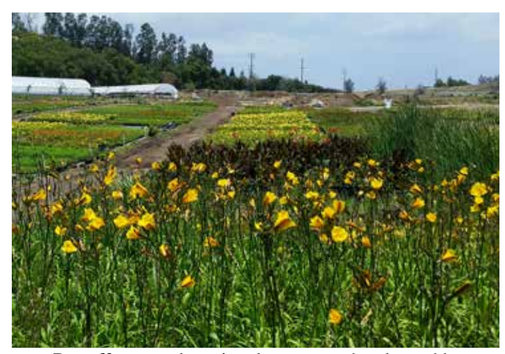
Runoff accumulates in a low area to be cleaned by Hemerocallis 'Elves' (front), cannas and cattails.

Pollinators - Our beekeeper keeps hundreds of hives here each winter. Pollen from our nursery plants helps the bees build strength for their trip to the almond orchards. Then they come back and pollinate our avocado blooms. Since we don't spray orchard weeds, our crew can selectively "weedwhack", avoiding lupines, butterfly weed, clover and other bee-friendly plants. This benefits native pollinators and butterflies as well as the beehives.