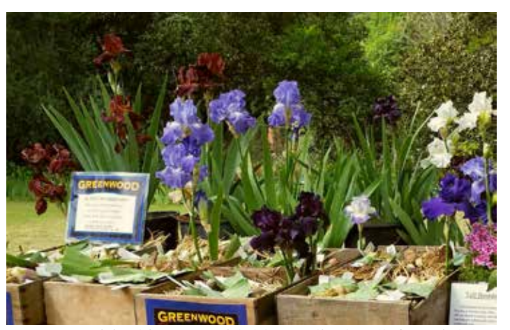
Bare root iris rhizomes with bloom display (left to right): Bernice's Legacy, Victoria Falls, Superstition (front), Frequent Flyer and Feedback (front)

What do you call a reblooming perennial with stunning blooms and handsome foliage that can survive three months without water? Underutilized! Bearded iris have large, showy, fragrant blooms and handsome silvery gray green foliage. In Southern California, they are far more heat and drought tolerant than our native California irises. Some bearded Iris varieties rebloom – up to five times annually. With proper selection, gardeners in California can enjoy blooming tall bearded irises all year.