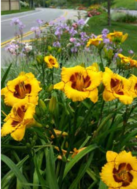
Black Suave/Tiger Time