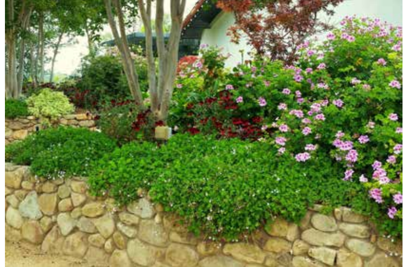
Silver Mint Rose (rear left), White Lady (foreground), Queen of Hearts (center) & Copthorne (right)

1-2" dusty red blooms Apr-Dec. A hummingbird treat. Extremely heat/drought tolerant. Sprawling or cascading growth. 15-24" Tall x 24-36" Wide.