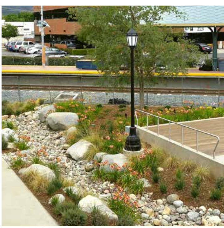
Daylilies and grasses absorb train station runoff.