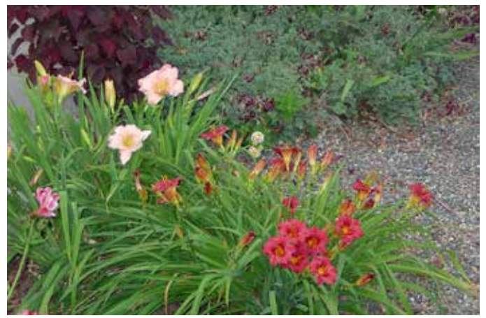
Rocking Cradle/Cranberry Baby

Consider Bloom Height - Daylily bloom heights range from 10 inches to over 6 feet. Of course short ones are great for edging and tall ones belong further back, but consider how high the blooms are held above the foliage. A variety with large blooms held just above the foliage (like the Vista<sup>TM</sup> series), provides a great mass effect and can can hide the "knobby knees" of rose bushes. A variety with blooms held high above the foliage would interfere with the rose blooms, but could be ideal in front of a low window. The foliage would not block the window and the blooms could be seen from inside.