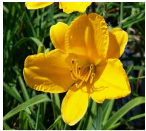
Both: Bright 'N Tight