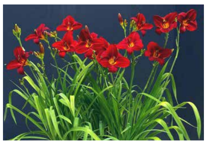
Frankly Scarlett survived fire and fire trucks.

People and Dogs? Woof! Cats? Careful... Daylilies are edible for humans or dogs, but not cats. Our dogs have played in and chewed on daylilies since puppyhood with no ill effects. Daylilies survive rambunctious puppies and dog urine. Neighbors' cats hunt in our fields regularly, apparently not tempted to eat the daylilies.