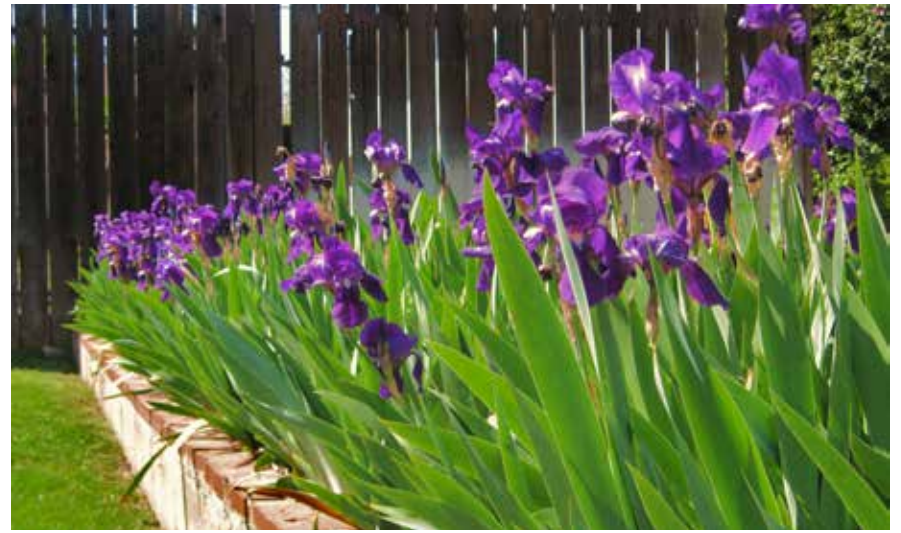
Great Grandma's Purple Flag in a brick planter

Provence, Tuscany – These two place names evoke romantic visions of lavender, rosemary, irises, citrus, Italian cypresses and more irises.