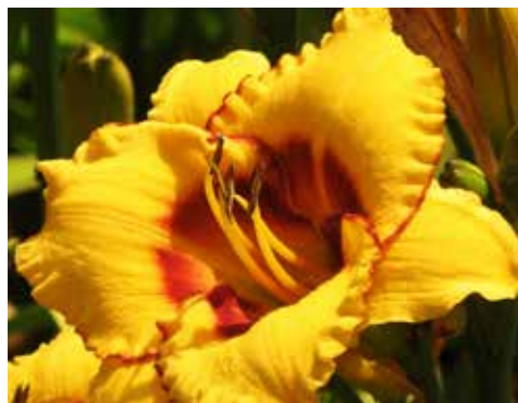
Black Eyed Sun