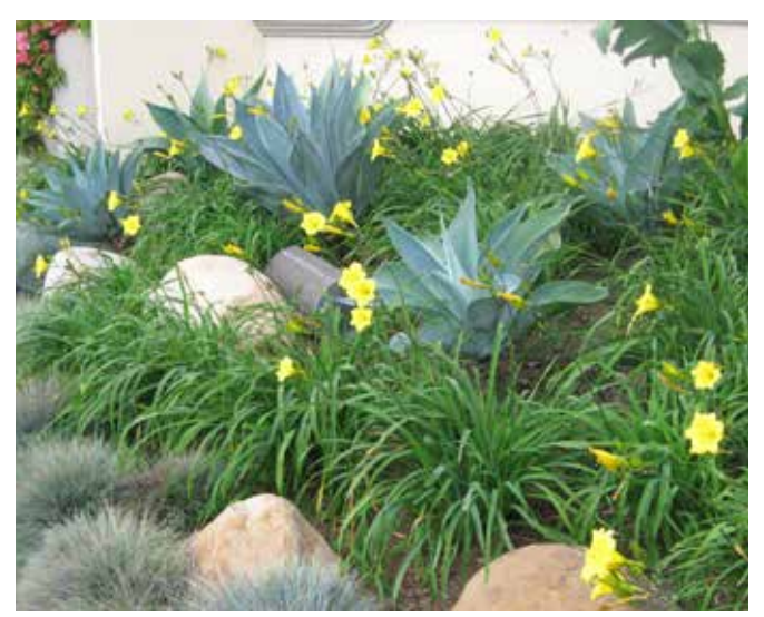
designWise® Bitsy growing with agaves.

They tolerate drought/flood, fire/freeze, physical and chemical abuse and still send up cheerful flower displays. No wonder Greenwood daylilies grow around Las Vegas casinos, Malibu mansions, Disneyland and a Saudi palace, along with schools, hospitals, and roadsides from coast to coast.