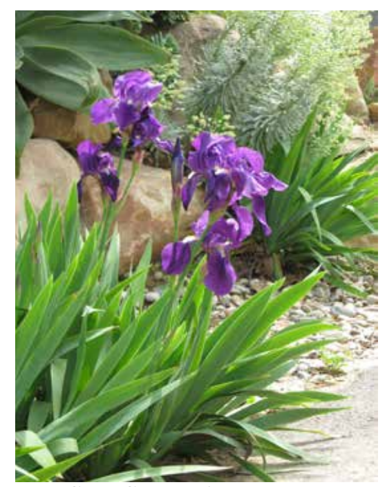
Great Grandma's Purple Flag

For optimum bloom, reinvigorate your iris clumps by digging and dividing them every 2-4 years. We fertilize in January/February and August/ September with Tri-C Humate (www.naturalsoilutions.com) 10 lbs per 1,000 sq. ft., gypsum at 30 lbs per 1,000 sq. ft. and 1-2 inches of compost. This routine is also great for other perennials and roses.