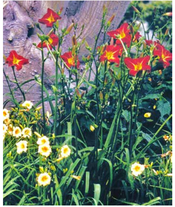
Rojo Alto blooming high above Tiny Pumpkin

A Word About White - Only one daylily variety, 'Gentle Shepherd' is truly white. Unfortunately its foliage is so unattractive and disease prone that we will not sell it. Our favorites, 'Polar Vista' and 'Lady Elizabeth' can appear white on their own or near dark foliage, but a hint of yellow shows when they adjoin white roses or alyssum.