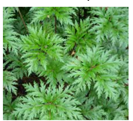
Geranium maderense (left -right): 'Alba' form, in the landscape, and close-up of foliage.