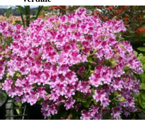
Pink Fringe Party