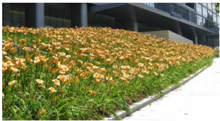
Judy Kolts, Avenue of the Stars, Century City

Planting on Slopes - Install 1 gal. plants 18"-24" on center, 5 gal. 24"-36" on center. Slow release fertilizer tabs help. For especially steep slopes or very large projects where digging holes is impractical, consider planting bare root daylilies with a ground cover pick.