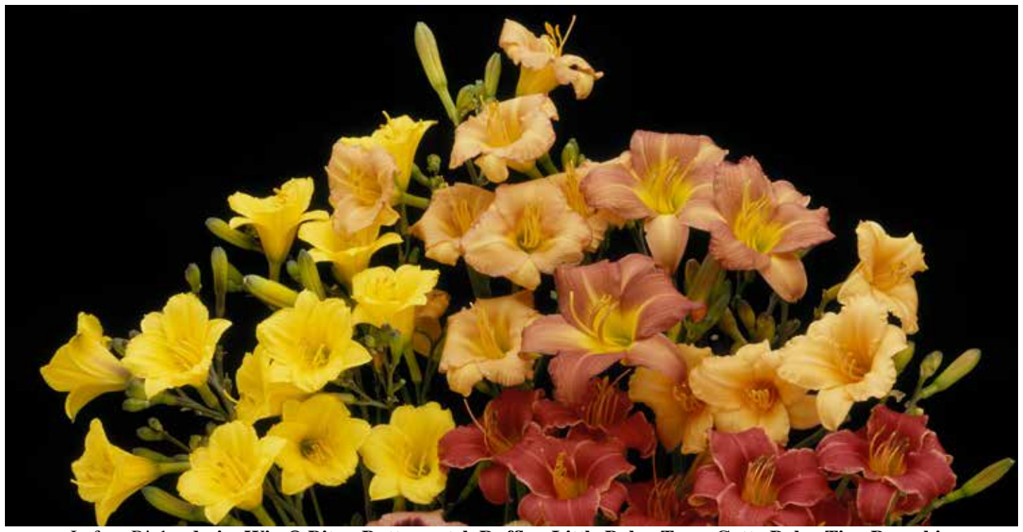
Left to Right: designWise® Bitsy, Butterscotch Ruffles, Little Bobo, Terra Cotta Baby, Tiny Pumpkin

For KEY TO DAYLILY SYMBOLS AND ABBREVIATIONS - see Page 9