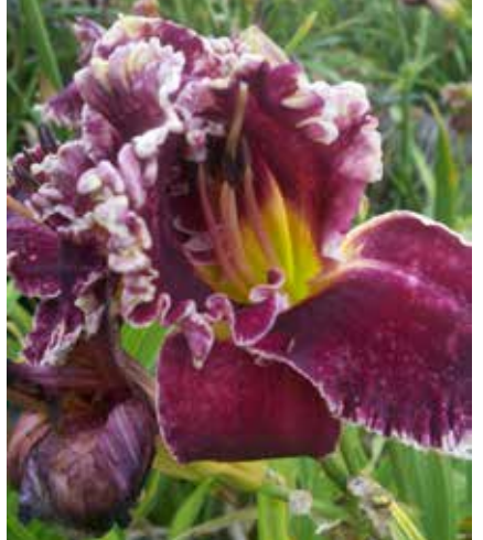
Fancy collector daylily looks great in Florida weather (Left), but cool Pacific nights hinder opening of fancy blooms (Right).

Beware of "Collector" Varieties - The web has an overwhelming array of daylily images with ruffles, picotees, and gold braiding. These exotic bloom are tempting, but keep in mind that most landscapes are viewed from a distance of more than 6 inches. Striking details on a show table may be lost in the garden. Beauty is personal.