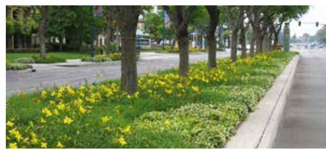
Miss Victoria, Harbor Blvd. near Disneyland

Daylilies work hardest for us in roadside and parking lot plantings. Minimizing glare and the heat island effect while consuming urban pollutants, daylilies tolerate temperature extremes, reflected heat, dust and occasional trampling. In cold climates daylilies survive road salts and snowplow blades. Daylily plants have no sharp thorns or branches to scratch cars or people.