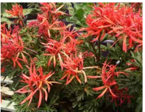
St. Elmo's Fire

White blooms randomly brushes with salmon, orange and red. Medium green foliage 15"-20" tall.