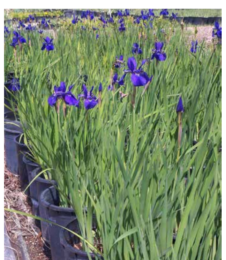
Siberian Iris 'Caesar's Brother'

'LA STUPENDA' (mauve with green throat) 'ROCKY HUNT' (deep blue)