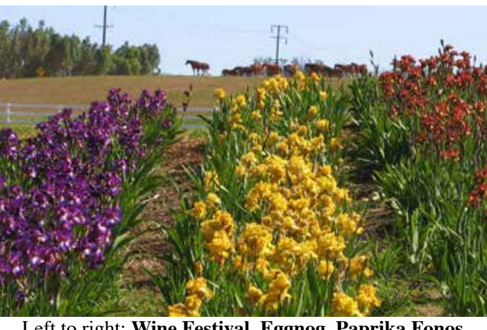
Left to right: Wine Festival, Eggnog, Paprika Fonos

Bearded irises range from 8" tall Miniature Dwarf Bearded through Intermediate and Tall Bearded. Since most smaller bearded iris varieties need a winter freeze to bloom well, we grow mostly tall beardeds. Bloom height depends on winter chill and spring temperatures. Varieties that are reliably tall for us (over 26") are noted.