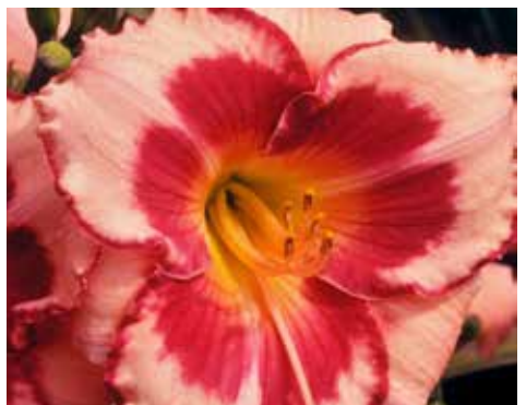
Blushing Summer Valentine