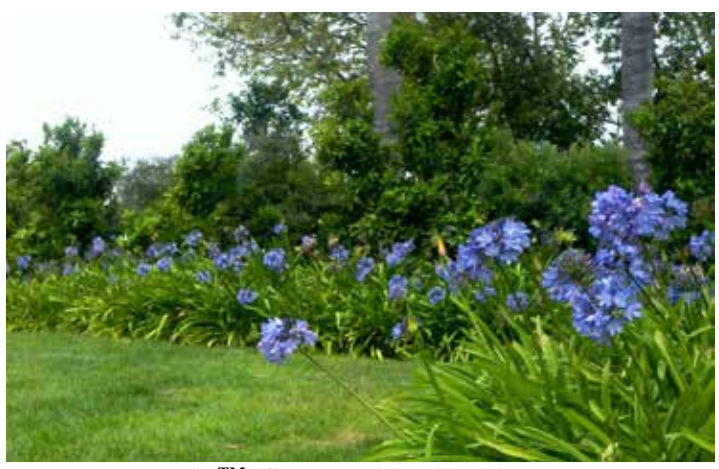
deja<sup>TM</sup> 'Sky Blue' April rebloom

Agapanthus are rightfully some of the most popular (some say too popular) perennials in California landscapes. Native to South Africa, they thrive in our climate, producing mass bloom displays with little water or care. The blue or white blooms complement the daylily palette, but other characteristics can use improvement. They usually bloom less than 2 months and most varieties have brown or yellow leaf tips during their summer and winter semi-dormancy periods. Some varieties, especially those sold as "White Peter Pan" have especially bad winter and summer foliage. There are so many different versions of "Peter Pan" in the trade that consistent results are rare. Baby Pete<sup>TM</sup> from Monrovia is in our opinion, the best "Peter Pan type" currently available. We offer two cultivars with improved bloom and foliage characteristics and will introduce more from our own breeding soon.