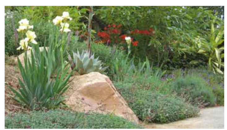
Total Recall with succulents and Pel. s. 'Burgundy'

Fire and Drought – Few plants can rival Tall Bearded irises for drought tolerance and fire survival, not even our own California native irises. We've seen Bearded Irises thrive after being dug up in 100 degree weather and left out of the ground for 2 months! Plants scorched by fire in November still flowered the following April.