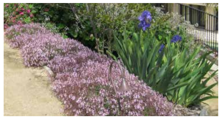
Pink Spice with Iris 'Victoria Falls'