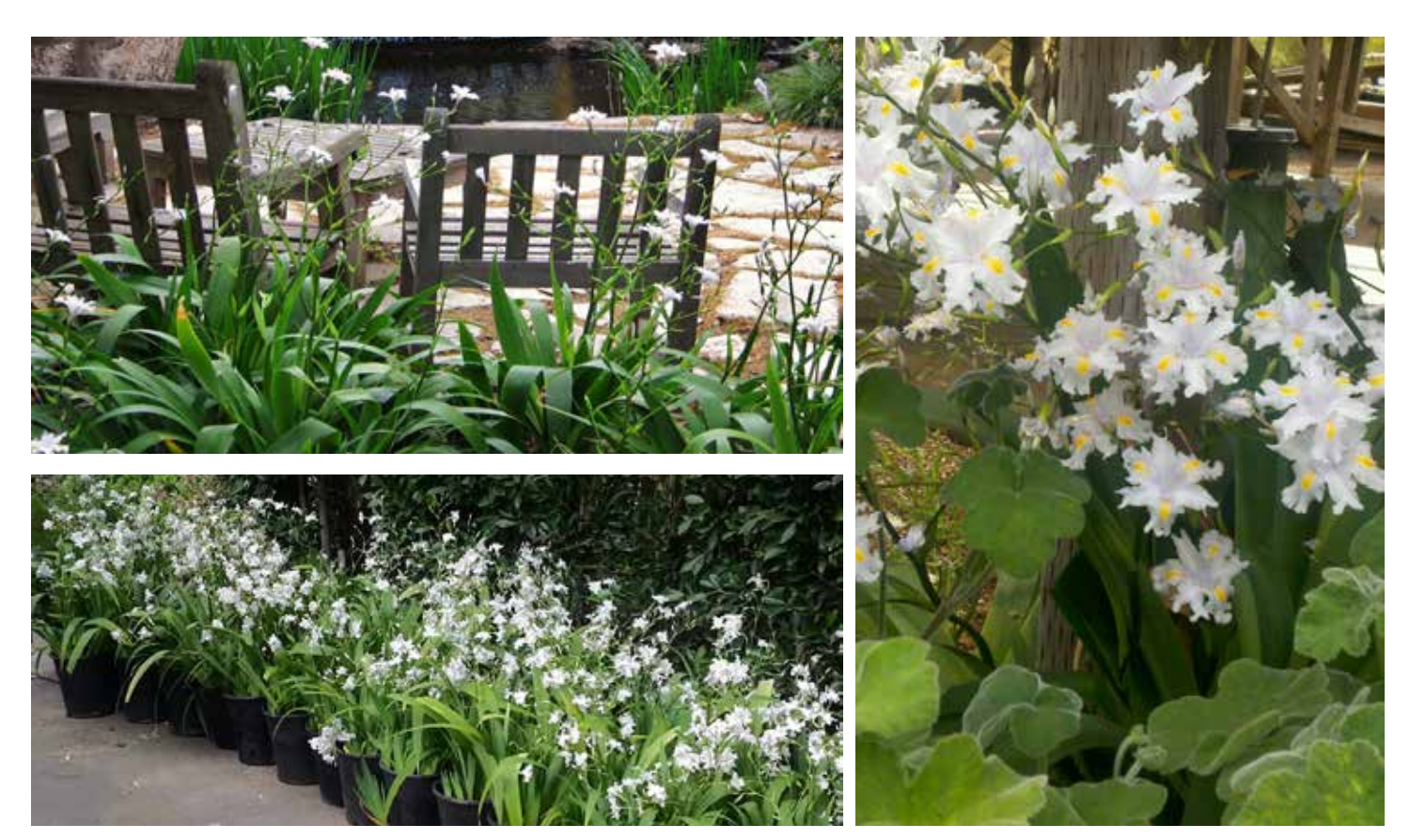
Iris x Nada, massed (top), in 5gal. containers (bottom) and with Pelargonium tomentosum (right)

Bare Root $8.00 1g $10.00 (9"-18" W x 14"-18" H) 5g $20.00 (18"-24" W x 22"-26" H)