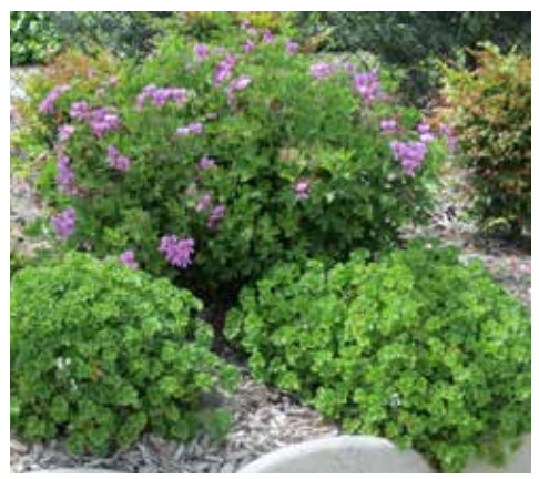
Aroma(front) and Lemon Fancy(back)

Leaves shaped like those of True Rose , but splashed with silvery variegation. Tidy spreading habit, pleasant mint fragrance and occasional lavender blooms. Excellent accent in part shade. 15"-20" tall by 18"-24" wide.