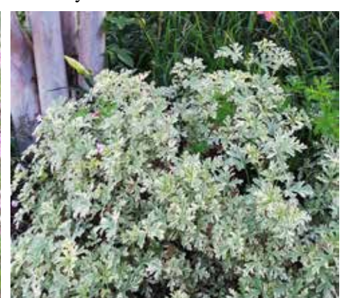
Silver Mint Rose