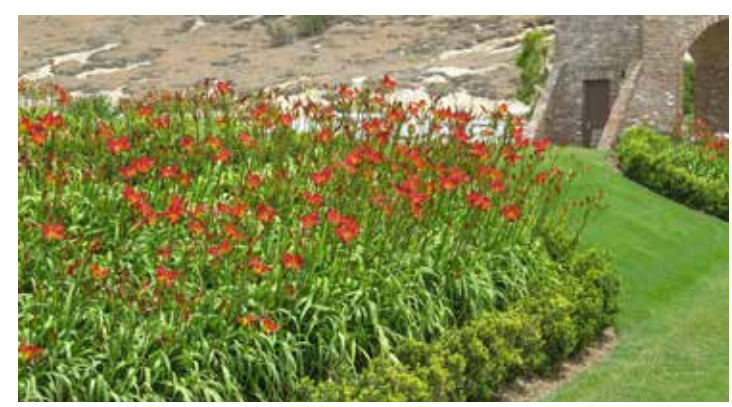
Rojo Alto, Hummingbirds Nest Ranch, Simi Valley

Additional erosion soon follows. The massive fleshy roots of daylilies penetrate deeply and hold rain soaked soil even if the foliage is compromised. Daylilies are especially useful in heavy clay soils. Sandy or rocky slopes require more mulch and water.