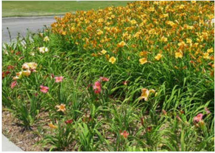
Bahama Butterscotch massed behind mixed daylily border at the Los Angeles Arboretum

Select Regionally Appropriate, Named Varieties - Daylilies thrive in all 50 states, but each variety has a favorite climate. The 3 most popular daylily varieties, 'Stella de Oro', 'Pardon Me' and 'Happy Returns', suffer in Southern California. They are deciduous (no foliage) for 3 months and require freezing winters. On the other hand, our evergreen winter-blooming varieties would freeze to death in Maine. Many Florida daylily hybrids require hot, humid nights for blooms to open, a disappointment in gardens with cool summer nights. A rare few varieties perform well across the U.S.A., earning the All American Daylily title. As a test site for this award, www.allamericandaylilies.com, we have access to nationwide daylily performance characteristics so we can help you succeed with daylilies wherever they are going. Amazingly, most nurseries and designers label daylilies by colors or just as "hybrids", an approach that ended with roses over 50 years ago.