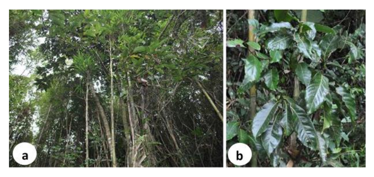
Figure 1 O. zahamenensis a) the whole plant and b) leaves

The plant samples were collected in the Mandraka forest (18°52'05.4"S, 47° 53'53.7"E, altitude 1412 m) located 70 km from Antananarivo in June 2021. The plant was identified by comparison of an herbarium made from the collected material with the voucher specimen n°12895 of the Botanical and Zoological Park of Tsimbazaza (Antananarivo) made by Van Der Werff.