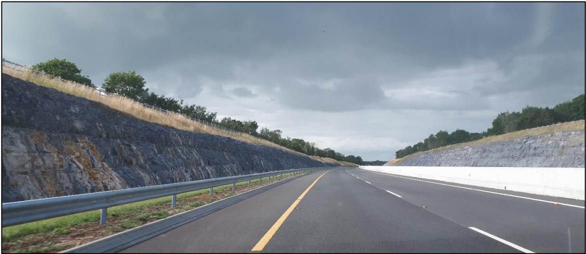
M18 road cut at Roevehagh viewed from northbound lane.