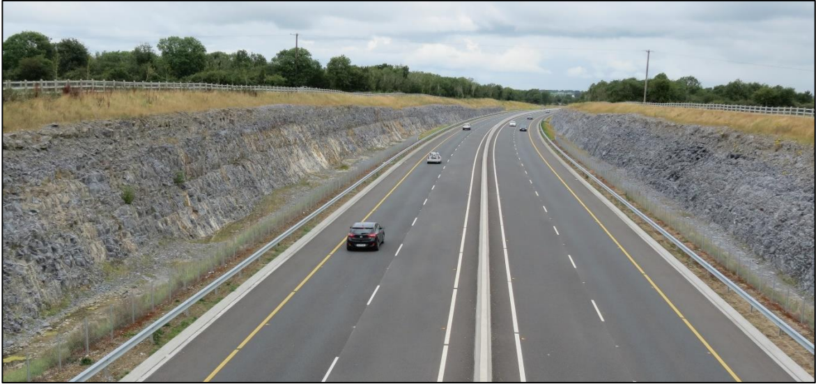
M18 road cut at Roevehagh viewed from road bridge looking north.