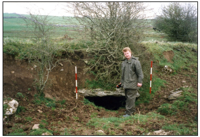
Outside the entrance to Oweynagat.