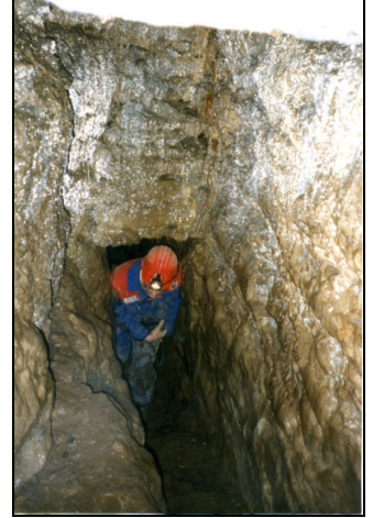
The stepped entrance looking inwards.