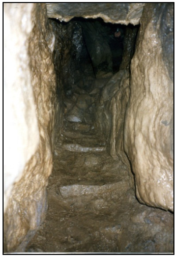
The stepped entrance looking outwards.