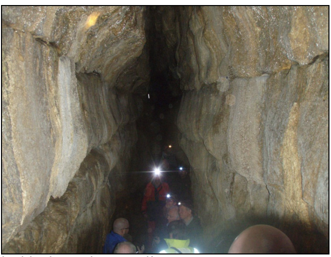
Inside the main cave rift passage.

Inside the main rift section of the cave.