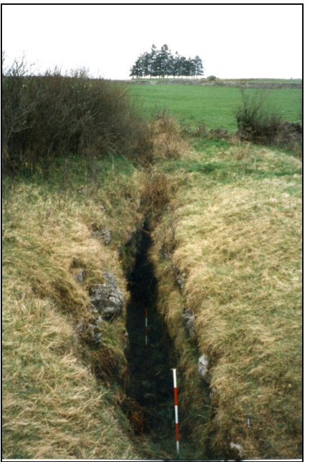
Unroofed cave passage near the cave.