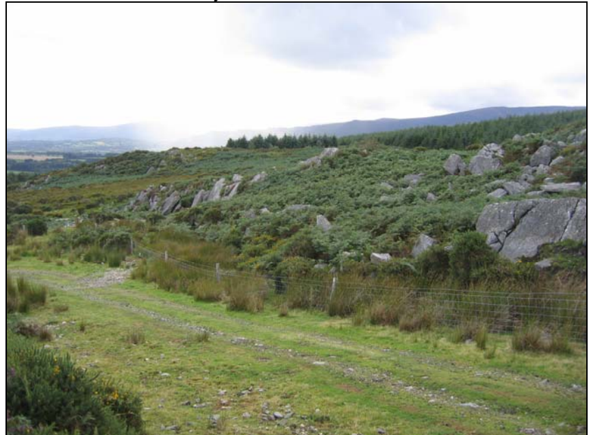
A view of the exposures of Devonian conglomerates adjacent to the farm track.

The quarry in the Kilmacthomas Formation with exposures of Devonian conglomerate visible in the short distance beyond.