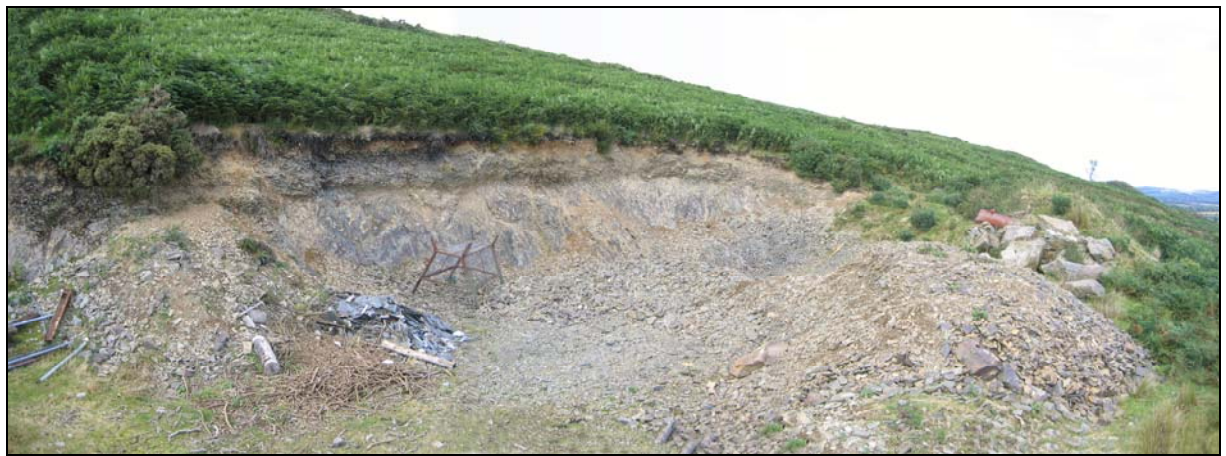
The farm quarry in the Kilmacthomas Formation.