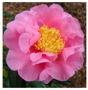
C. retic 'Dream Girl' L to VL, vigorous upright growth. sasq. 'Narumi-Gata' x retic 'Buddha' (U.S. 1965 -Howard Asper, Escondido, CA).