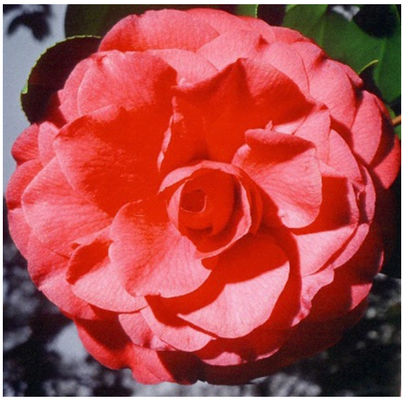
C. reticulata 'Pagoda' originated during the Yuan Dynasty (1347).