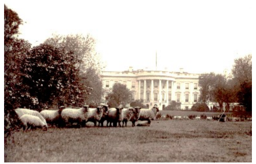
Sheep keeping the grass short on the White House lawn during WWI.

The War Years. With the advent of World War I, garden projects took a back seat as the work force was diverted to defense. By the spring of 1918, a herd of