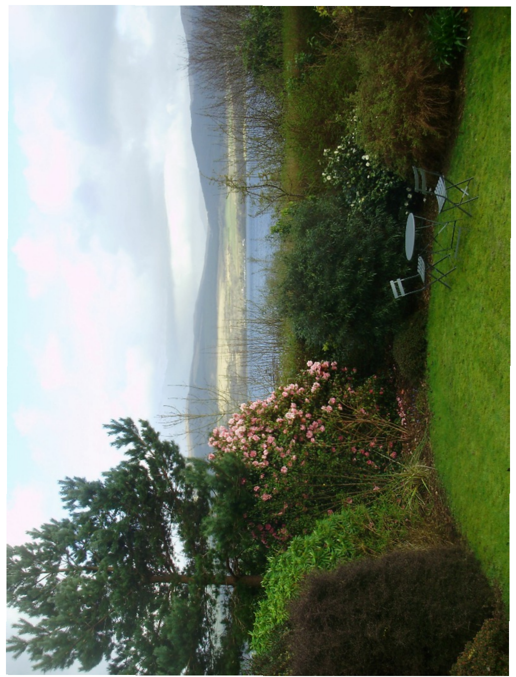
My friend Duncan Beaton sent this recent picture of a corner of his garden in the village of Furnace, Argyll, Scotland, with a williamsii hybrid 'Donation' in full bloom on the left. The one on the right is Charlotte de Rothschild. The view is looking east across Loch Fyne and on many mornings the sunrise is spectacular. (-ed.)