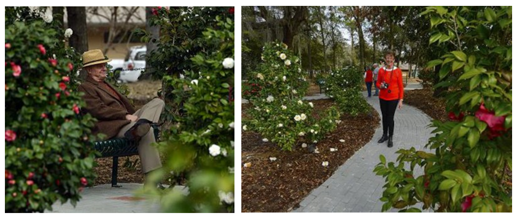
Visitors to the University of West Florida Camellia Garden Enhancement Ribbon Cutting Ceremony enjoy the new walkways and seating improvements. The Garden is a joint venture between UWF and the Pensacola Camellia Club.