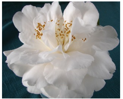
C. japonica "Bessie Battle" 1999, by Tom Dodd, Semmes, AL