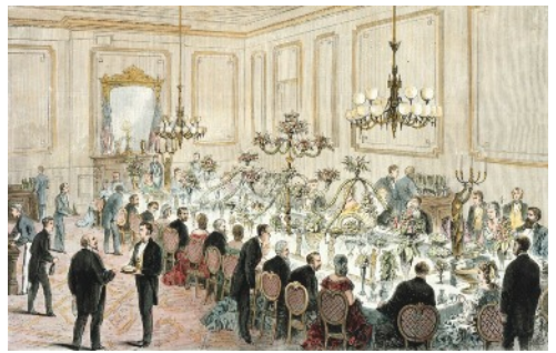
James Monroe's 'plateau' decorated with wax flowers.

But it was not always so. In the early years, people objected the use of cut flowers indoors. They believed that fresh flowers "drank up the oxygen in the air and sent harmful vapors into the room." As a result, wax flowers were used. The earliest record of these describes the wax flowers used by James Monroe (1817-1825) which he placed in his 13-foot bronze and mirror plateau he had ordered from France for his banquet table. Wax flowers had the delicate and subtle coloring of the real thing and enjoyed a long history of use in the state rooms of the White House.