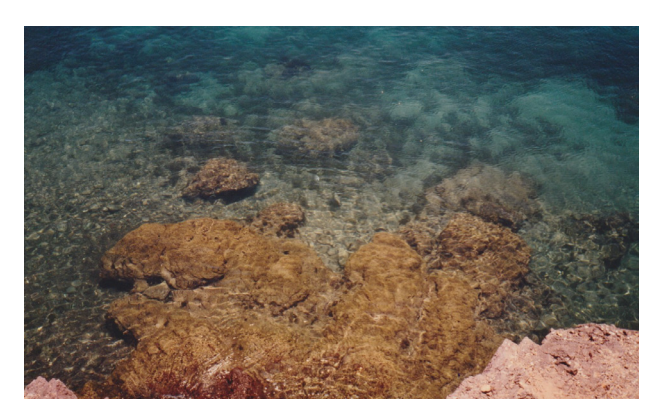
Looking down from the veranda into the bay.