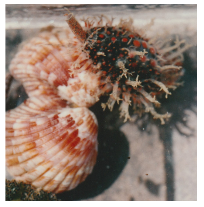
Americardia biangulata being examined by Jenneria pustulata in the tank. Usually we place sand in the tank bottom but clean sand was difficult to get where we were because of all the rocks.