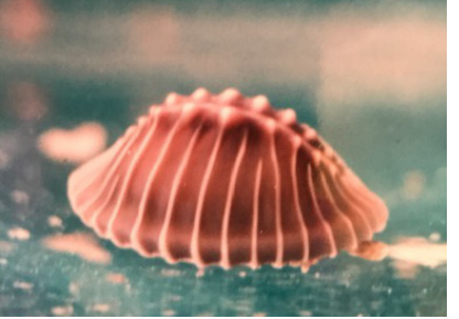
Trivia sanguinea was shy. It never came out and crawled around like it's cousins.