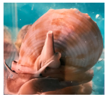
Phalium centiquadrata in tank before attack

Further around the point the bay became sandy and was home to a variety of different species especially bivalves. There we discovered Megapitaria aurantiaca , M. squalida , Crucibulum spinosum , Tivela planulata and, my first and only, Tellina felix . Aside from the Tellin the prize of the area had to be Phalium centiquadrata which, I think, would be the cognate of our Scotch Bonnet. Please bear in mind that this list contains just a few of the sand/mud dwellers of the area.