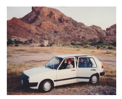
One of our rentals.