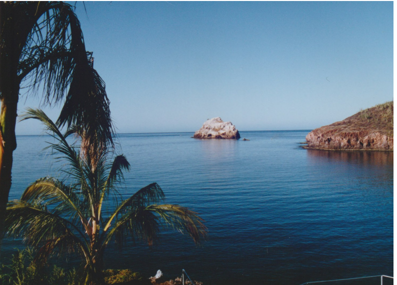
Guano Island. Can you guess why this island is white?