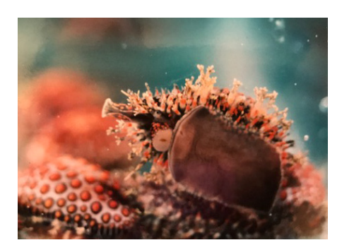
Jenneria pustulata exploring the sides of the tank. You can see the mantle and underside of the foot easily.

The final habitat was a broad sandy beach at Empalme. Low tide was before sunrise so we drove there in darkness. It was desert and cold. Jim built a fire of dead plants on the beach because the temperature was around 40 degrees F.. The rest of us walked very carefully along the beach using our flashlights for guidance. We needed the light to spot the half buried Pitar lupanaria whose needle sharp spines protruded from the clean sand. With the sunrise we began to find other treasure. We found stranded Euvola vogdesi , Argopecten circularis .(Currently there seems to be some controversy regarding this name. I have not been able to resolve it to my satisfaction so I will use this until I can.), Leukoma grata and Agaronia testacea , Panama False Olive. The latter species proved to be a bit of a problem.