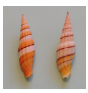
Left: Vexillum citrinum (Gmelin, 1791) Regal Miter Right: Vexillum taeniatum (Lamarck, 1811) Ribboned Miter