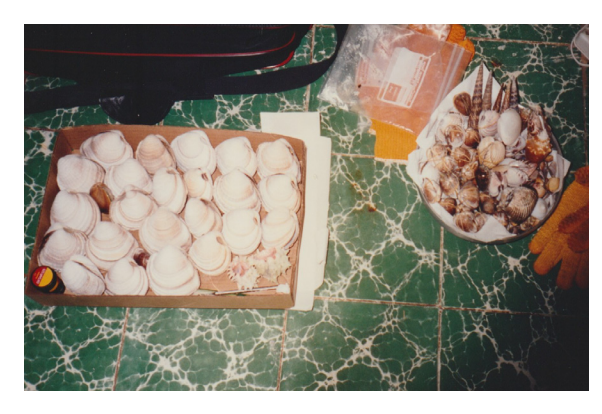
Much of a trip is spent sorting and cleaning. Jim must have bought a case of Pepsi for all of the Chione gnidia are neatly arranged in a flat.