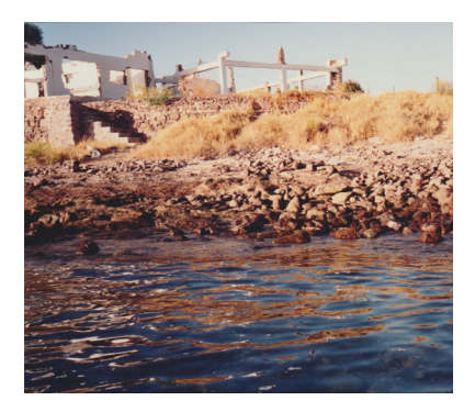
Part of the steps going down to the water.