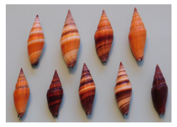
Vexillum vulpecula (Linnaeus, 1768) Little Fox Miter

Over the years we've been reasonably true to that pledge of miter abstinence. Today our collection contains just over 210 lots of "miter" shells. The miter is in parenthesis because the Mitridae has since been subdivided into two families - each large in its own respect.