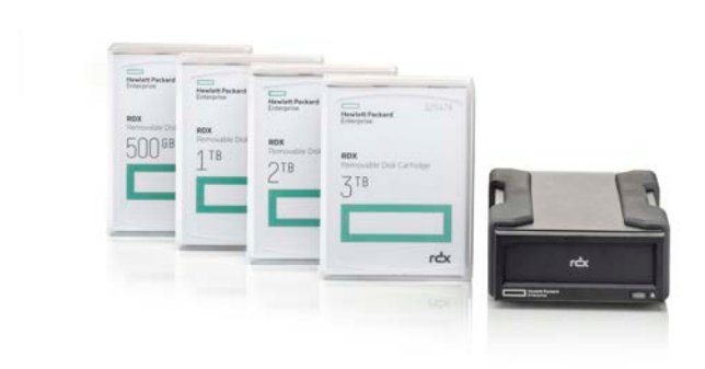
HPE RDX Removable Disk Backup System

HPE RDX Removable Disk Backup System is a disk-based back up and recovery solution with critical security layers, unmatched portability, fast recovery and easy integration into any small business environment. Its also rugged, removable, easy-to-use, and cost effective for remote or branch office locations, small offices or home offices with little or no IT resources. HPE RDX works exceptionally well in harsh work environments where businesses need to protect, manage, transport or capture large amounts of data in less than ideal locations.