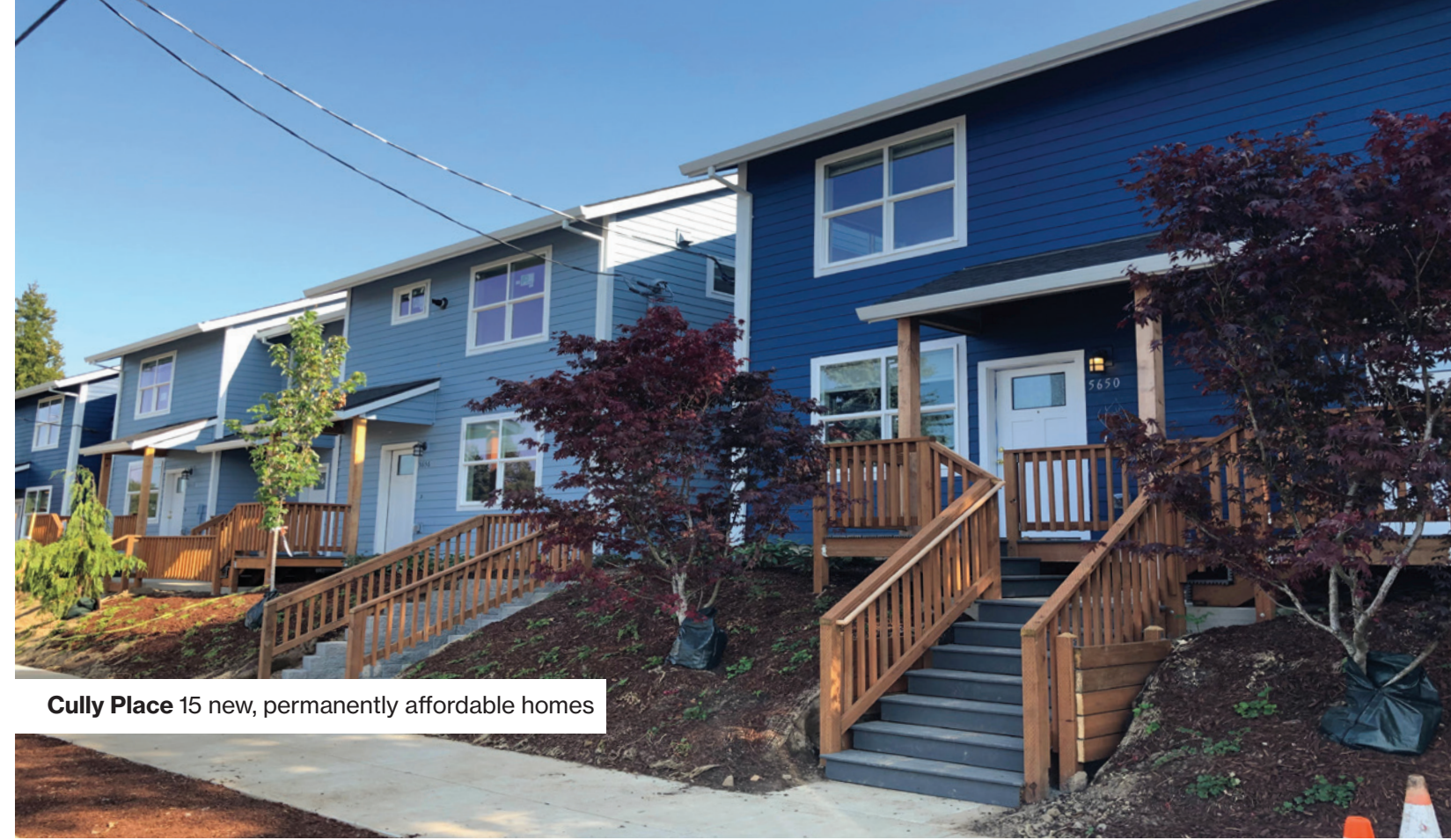
Cully Place 15 new, permanently affordable homes

of Habitat homeowners need an accessible home for their family members with a disability. All Habitat homes are built to be visitable by a person in a wheelchair.