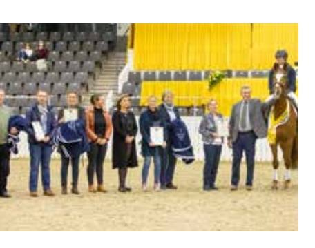
As part of the show programme, the breeders of the Hannoveraner eventing horse champions were honoured.

in Lucina is home to many successful Hannoveraner stallions. Some of these are used directly or via stallion owners in Germany – often also in the centre of the breeding area. The stallion sales took a very positive course. An increase was recorded in