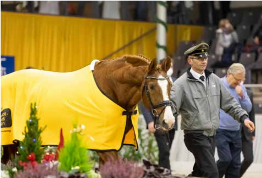
Like his sire Stakkato, the Stanley has a high breeding value. He was awarded the Grande Preis in 2021.