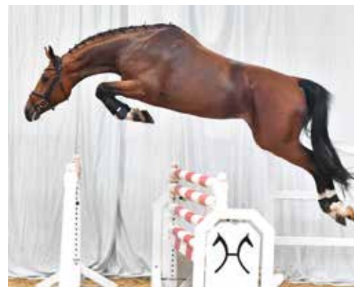
For the most expensive jumper, Quality Top by Qualito/Grey Top, 46,000 Euros had to be invested.