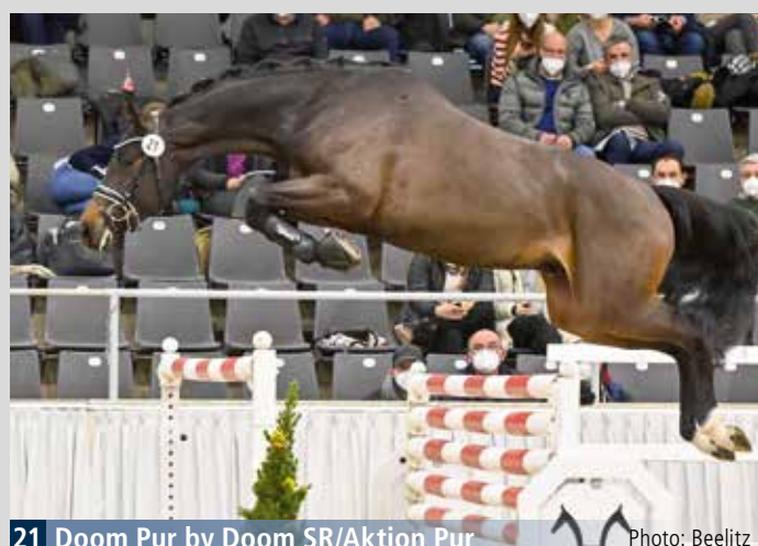
21 Doom Pur by Doom SR/Aktion Pur

Over the jump this brown stallion is a rubber ball, yet wiry and modern. He is always focused on the jump and has good reflexes. Everything looks very easy and simple when he jumps.