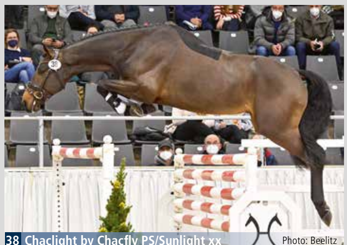
38 Chaflight by Chacfly PS/Sunlight xx

A highly elastic and noble stallion, who presented himself relaxed and powerfully in his movements and at the fence. Seeing him together with his dam and granddam in the show programme gave a good overall picture.