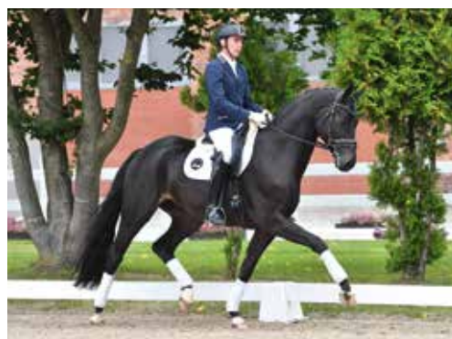
Frido by Finest/Spörcken was sold at 56,000 Euros to Spain.