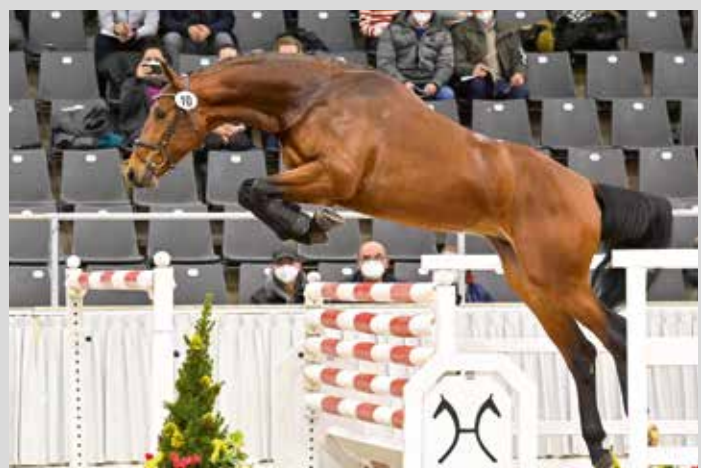
10 Bay by Conthargos/Kannan

A tpey, athletic stallion from the best dam line with top genetics. He came to the jump with traction and is endowed with the best ability and great cleverness. In addition, he has a powerful canter.