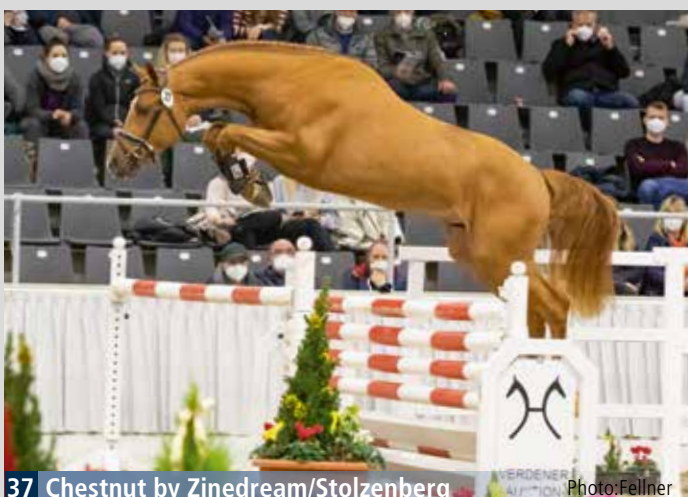
37 Chestnut by Zinedream/Stolzenberg