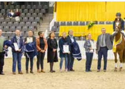
As part of the show programme, the breeders of the Hannoveraner eventing horse champions were honoured.

in Lucina is home to many successful Hannoveraner stallions. Some of these are used directly or via stallion owners in Germany – often also in the centre of the breeding area. The stallion sales took a very positive course. An increase was recorded in