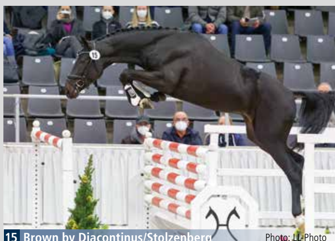
15 Brown by Diacontinus/Stolzenberg