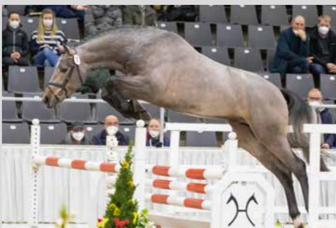
7 Grey by Checkter/Stolzenberg