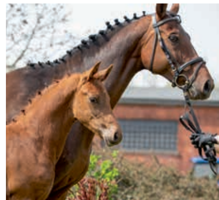
In May last year, Sir Beverly Hills by Secret/Christ was part of the online collection. He was sold at 24,000 Euros.