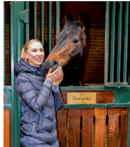
Am Beginn seiner Laufbahn steht der dreijährige gekörte Hengst Endorphin by Escolar/Don Nobless.