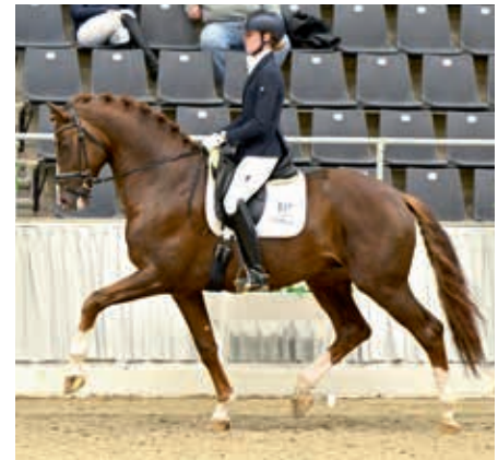
Ibiza Dream by Ibiza/Dimaggio