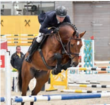
Kataro by Karajan/Perigueux