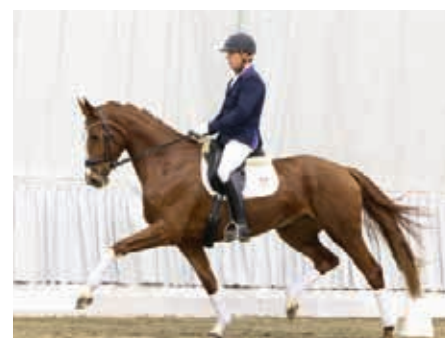
At the January 2020 auction, Filia by Floriscount/Charon was discovered to be one of the best six-year-old dressage horses in France.