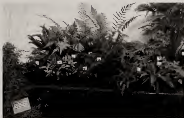
HFF booth at the Puyallup Fair

In September 2013 the HFF undertook a new form of community outreach. We decided to have an informational booth at the Puyallup Fair. Previously, most of our activities have been focused on events in the Seattle area such as Fern Fest and the Flower and Garden Show. Having an exhibit at the Puyallup Fair gave us an opportunity to increase our exposure and reach a much larger demographic.