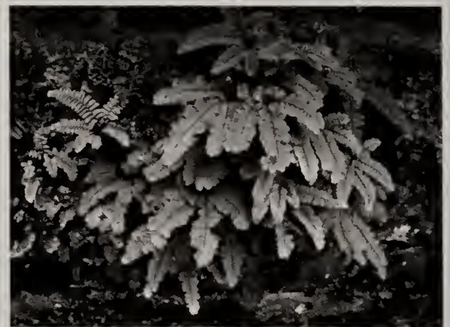
Adiantum aleuticum 'Subpumilum'

The first site for our final day was Bosvigo, a relatively small garden just round the corner from our hotel. Owner Wendy Perry met us as rain started to fall and explained that the garden is full of interesting plants as well as ferns. We then started exploring the various parts of the garden. Most ferns were in the woodland garden as expected, with many cultivars, not my area of expertise. However under one tree was a colony of a puzzling Dennstaedtia that was eventually determined as the