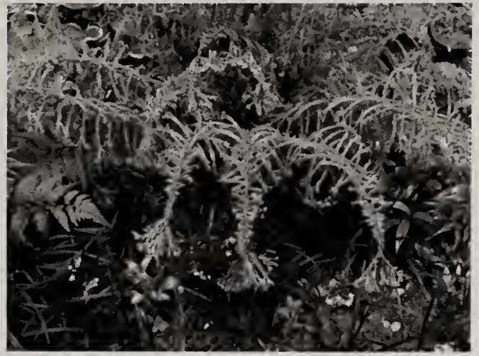
Athyrium filix-femina 'Victoriae'