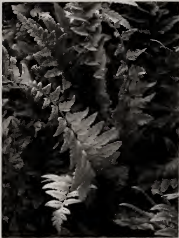
Dryopteris tokyoensis

Description: The rhizome is rather short and erect to ascending, forming offshoots sparingly. The straw-colored stipes are roughly one sixth the length of the frond, grooved and densely covered with scales near the base. The lustrous pale brown scales are membranous and lanceolate to elliptic in outline and abruptly acuminate. They are a bit darker near the base. The fronds are deciduous and lanceolate, widest just above the middle and narrowing gradually toward both ends. The fronds form an attractive slender rosette or cluster. The 20 to 40 pairs of pinnae are widest near the midrib of the frond and taper toward the pinnae apex. Considered once-pinnate pinnatifid or pinnately lobed, the margins of pinnules are elliptically lobed but the apex of the pinnae is sharply toothed. The pinnae are slightly auricled at their base. The lower most pinnae are greatly reduced to mere ear-like lobes or technically deltoid-ovate. The fertile pinnae in the upper part of the frond are somewhat contracted. The sori are large and numerous, usually in two series and nearer to the costas than to the margins. The indusia are orbicular-reniform, that is, kidney shaped.