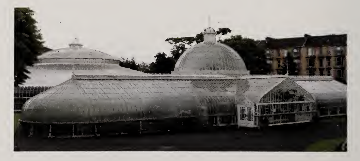
Glasgow Botanic Garden conservatory

Loyd and Sue went out to explore Glasgow, but only made it a few blocks to the Botanic Garden and spent the entire day there. When they returned they had scoped out a restaurant that was built in an old church and we went for dinner there. Had a great time! Back to the hotel and off to bed.