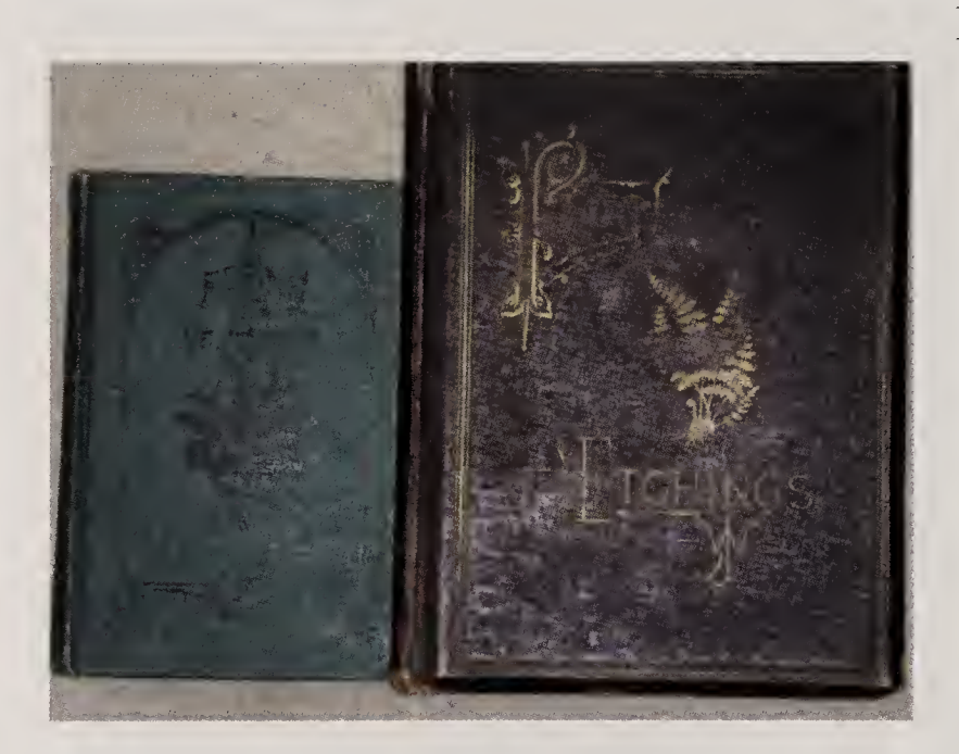
Covers of Williamson's two books side by side, 1878, 1879

was over! This book was then, and probably still is, one of the finest fern books produced anywhere in the world. Some of the, presumably, spare plates were recycled in Beautiful ferns , a later publication by Eaton which appeared in several issues from 1881 to 1892.