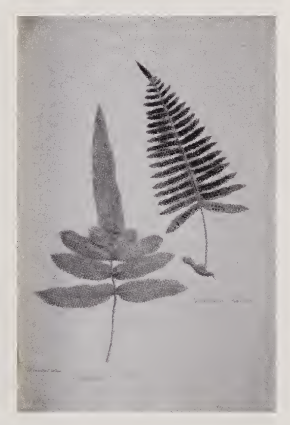
Sample plate from Raddi, 1825. Plate 29 - Polypodium hirsutulum (left), Polyodium glaucum (right).