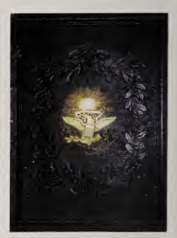
Front cover of Brackenridge