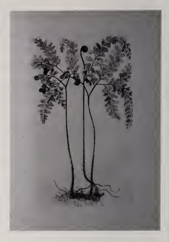
Plate 11 of Adiantum pedatum from Fern etchings, 1879.

Eventually at least 27 parts were issued, volume one, published by S E Cassino, appeared in 1879 and the project was completed with volume 2 issued in 1880. It was available in a large quarto format. The two volumes contained 80 magnificent colour plates produced by Emerton and Faxon and 682 pages of text, in English. The wait for a good book on the ferns of the United States