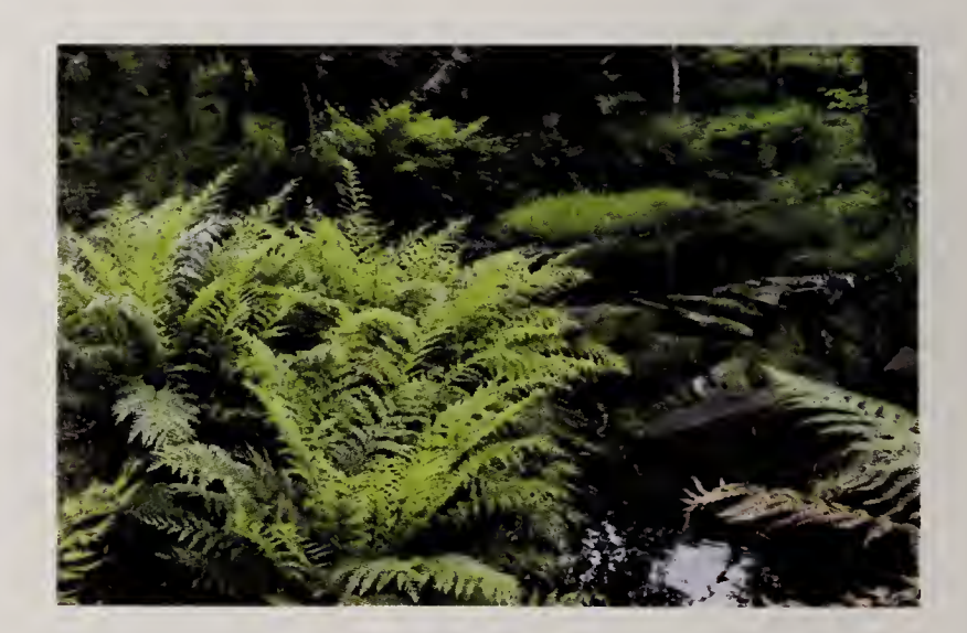
Hardy Fern Foundation Quarterly