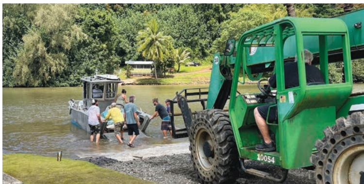
Our team on Kaua'i immediately jumped to action to help those cut off by the March 11 landslide in Hanalei. Community members used their boats to transport food and supplies to isolated residents.

Over the years, Hawaii Foodbank has built a strong reputation for disaster preparedness and relief. When Hurricane Iniki devastated Kaua'i in 1992, our organization responded immediately by sending 1.5 million pounds of food to relief sites across the island. Our contributions to the Iniki relief efforts garnered statewide recognition – establishing Hawaii Foodbank as an important disaster