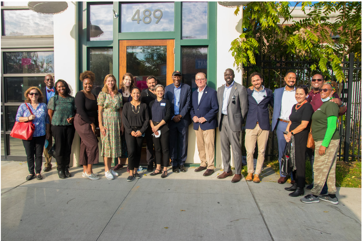
The WJWI team joined the Education Redesign Lab on a visit to the City of Poughkeepsie to learn about their efforts to create cradle-to-career systems of opportunity.