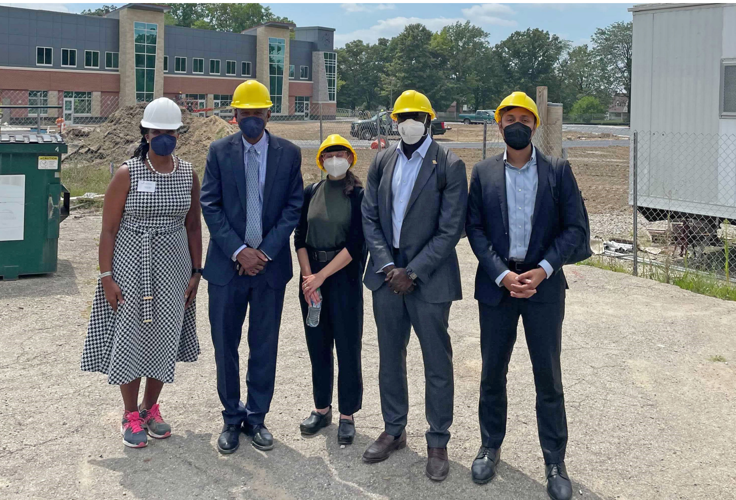
The WJWI team visited the site of the new HOPE Center in Northwest Dayton, part of a trip in support of the Northwest Dayton Partnership.