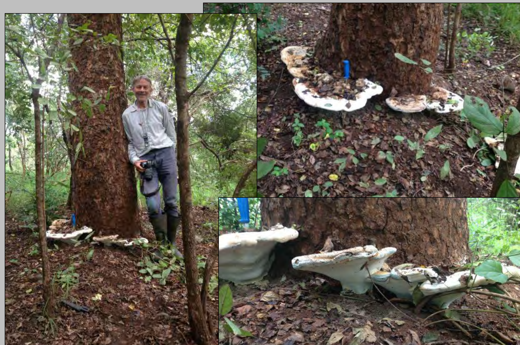
Pseudopiptoporus devians (Bres.) Ryvarden, encircling the butt of a living Sclerocarya birrea tree, with the author of the combination standing to the right. Ryvarden erected the genus in 1980 based only on the type collection that had been made in 1913 in Zumba, Tete Province, Mozambique – far northwest of GNP near the Zimbabwean border. This is the first known collection since that date.