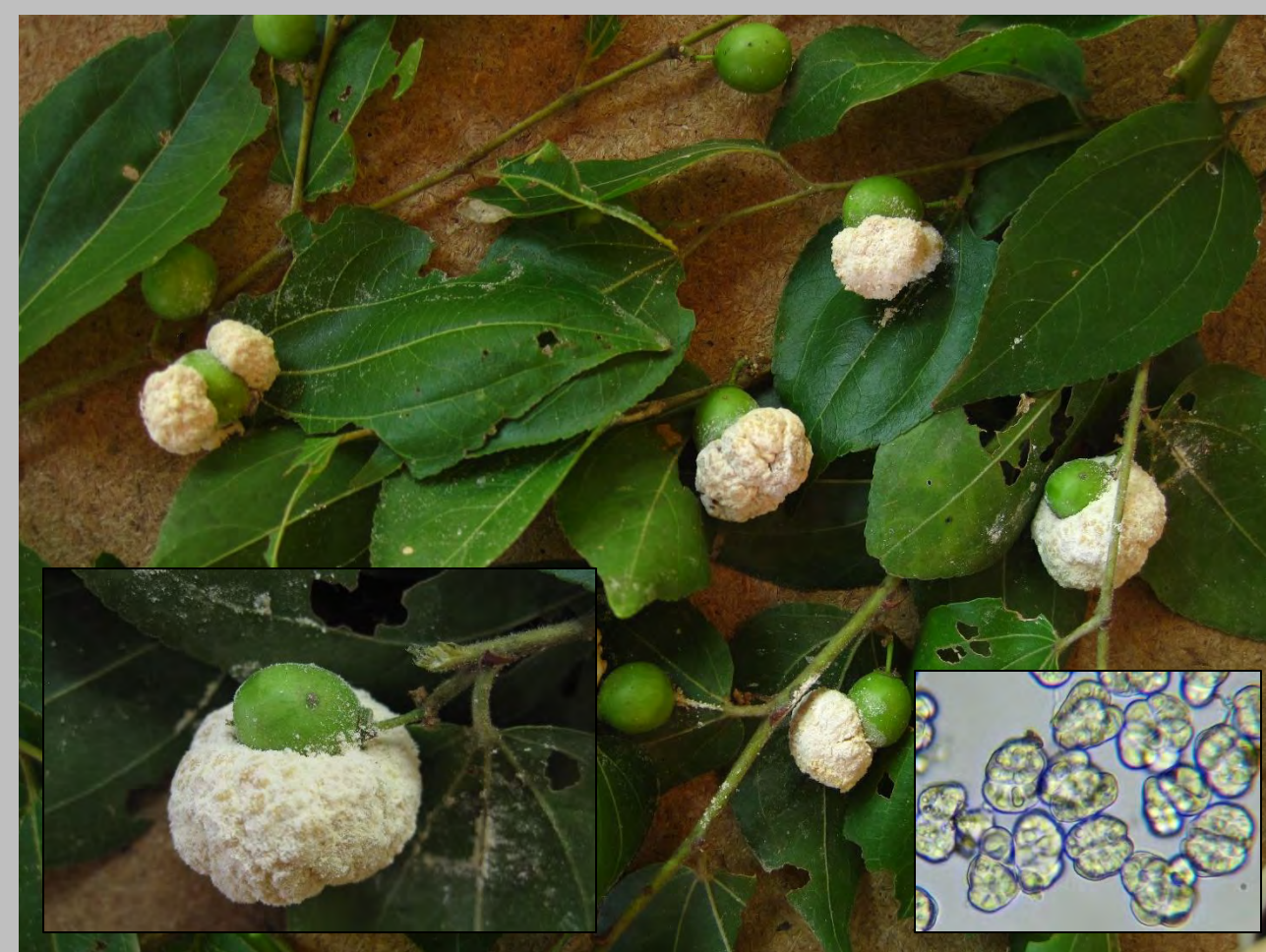
Coniodictyum chevalieri (Basidiomycota, Exobasidiales), parasite of Ziziphus mucronata fruits. Ours is the first report of this fungus in Mozambique. Insert: (R) basidiospores.

Gorongosa National Park (GNP) was a frequent battleground during the Mozambican Civil War (1977-1992) and was left unprotected for a decade after cessation of hostilities. In that time, the Park's fauna was decimated. Today, restoration of the wildlife and tourist infrastructure is advancing apace with support from the Gregory C. Carr Foundation. The establishment of the E. O. Wilson Biodiversity Laboratory in the Park, modeled along the lines of the Smithsonian Tropical Research Institute on Barro Colorado Island in Panama, provided an attractive research destination.