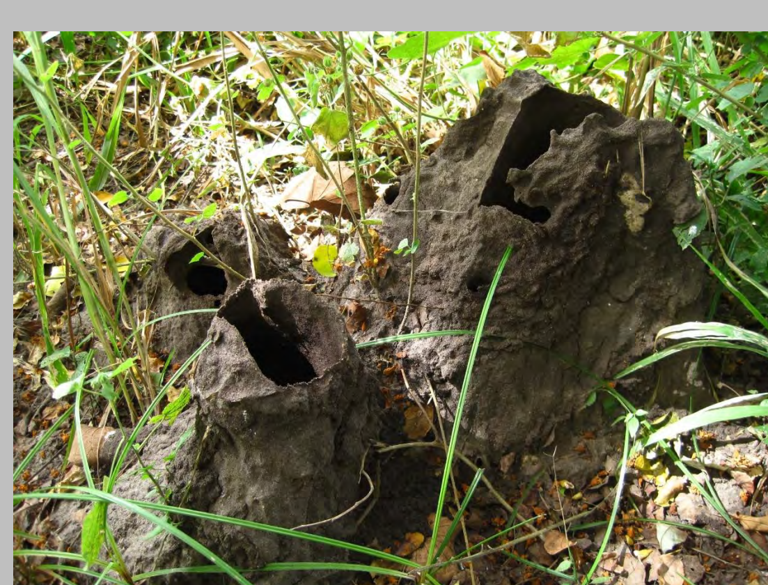
(L) A small termite mound. (R) A view down the opening of one of the mounds reveals Termitomyces sp. colonies at the bottom of the "shaft" (specimen not collected).

We are currently making determinations of these and will publish our results in the form of a checklist. Voucher specimens will be deposited at the Biodiversity Collection at the E. O. Wilson Biodiversity Laboratory at GNP, the Herbarium of Eduardo Mondlane University in Maputo (LMU), the Farlow Herbarium (FH) at Harvard University and the University of Illinois Herbarium (ILL).