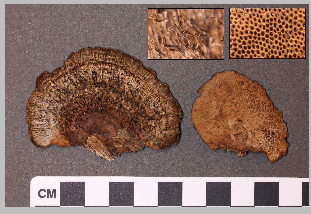
Hexagonia hydnoides (Basidiomycota, Polyporales). On dead wood. Inserts: (L) detail of hairs on upper surface; (R) detail of pore surface.