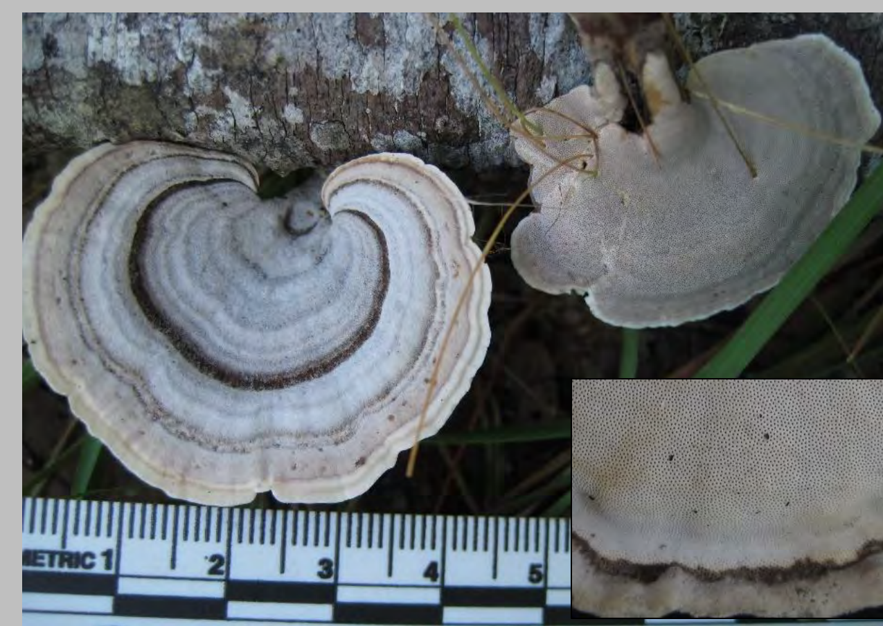
Microporus quarrei (Basidiomycota, Polyporales). On dead wood. Insert: detail of pore surface.