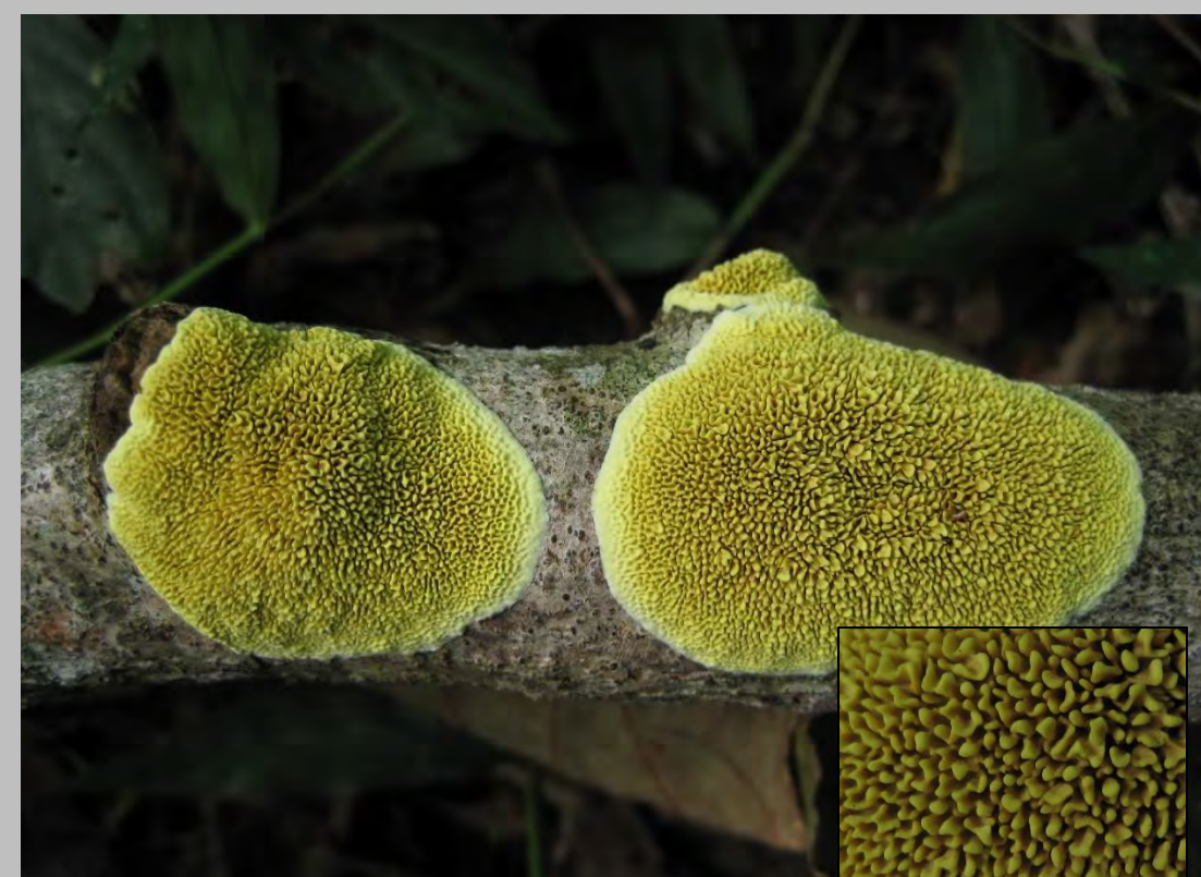
Flavodon flavus (Basidiomycota, Polyporales). Insert: detail of hymenial surface.