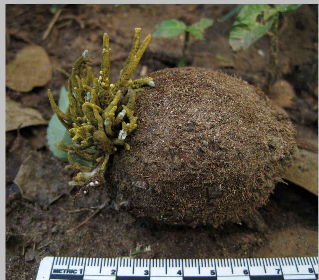
Sarophorum palmicola , anamorph of Penicillioopsis clavariiformis (Ascomycota, Eurotiales) emerging from the soft spot of a rotting fruit of the palm Hyphaene coriacea .