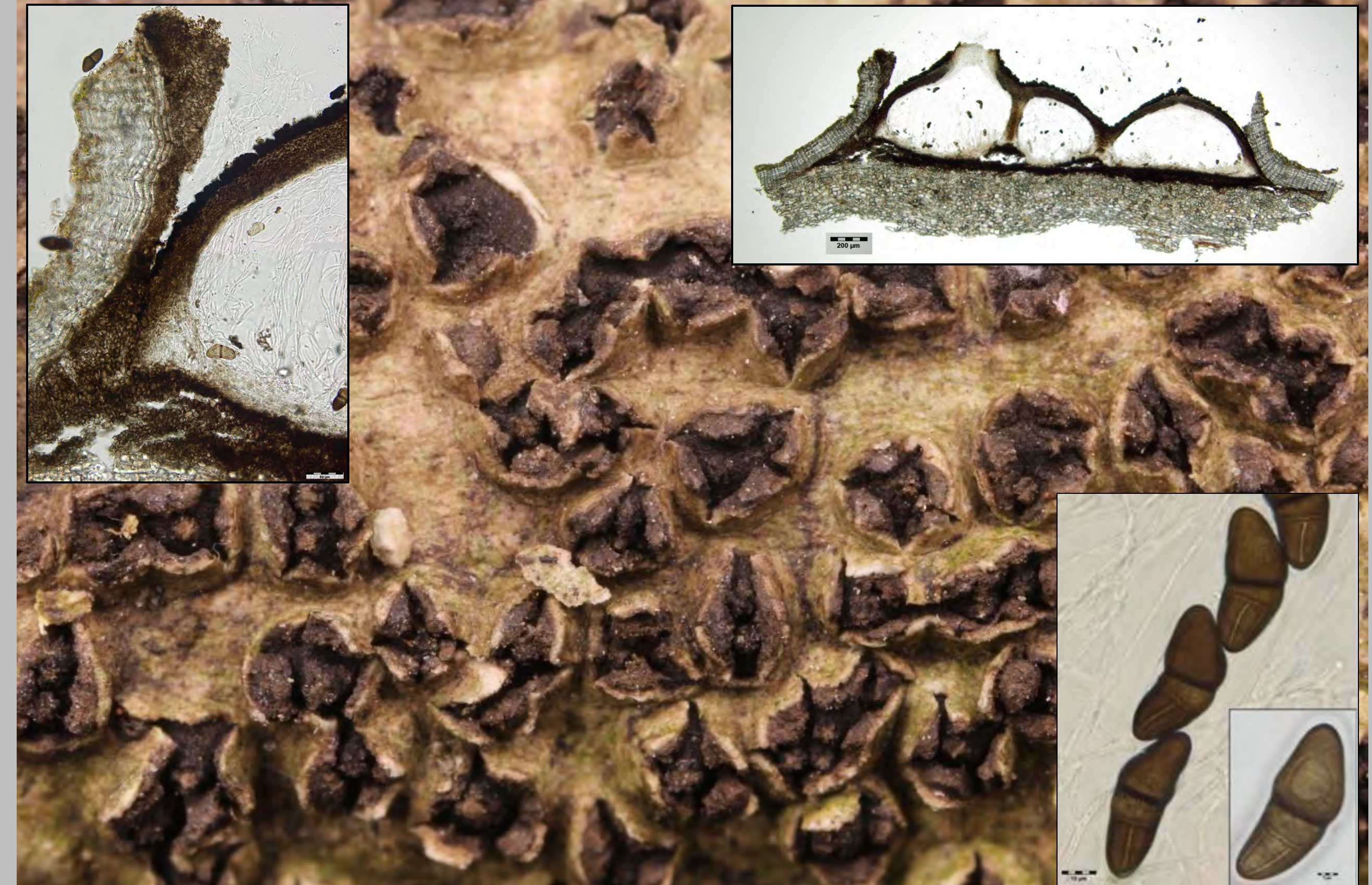
Mystery fungus! (Dothideomycetes, Pleosporales). Ascomata covering trunk and branches of fallen sapling. Pseudoperithecia developing within stromatic tissue (upper left insert, detail of section shown in upper right insert). Lower right insert: ascospores (stacked image). Asci clearly bitunicate with an extensible endoascus. Pseudoparaphyses frequently anastomosing, forming a net-like tissue. Do you know this fungus? Please write in your ideas here with your name and email address. Thanks!

We conducted a fungal survey of GNP in June-July of 2016. Our survey was conducted in the beginning of the dry season and our collections represent species in fruit during a season that is not often sampled. We collected voucher specimens at random localities and habitats within the Park, focusing on discomycetes, polypores and anamorphic fungi. Despite a severe drought that had affected the region that year, we made over 500 collections.