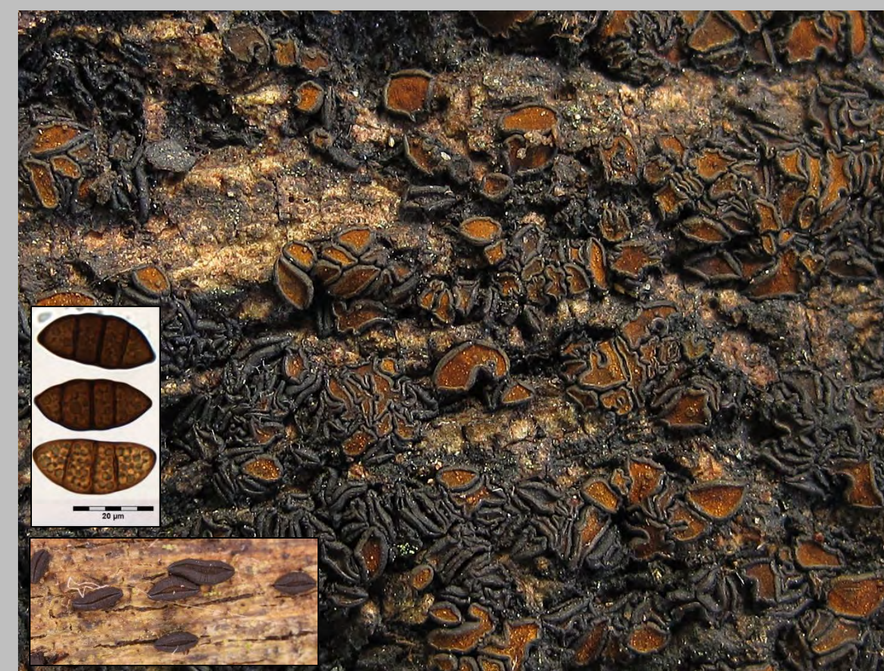
Rhytidhysteron rufulum (Ascomycota, Patellariales). Ubiquitous, on dead twigs and branches. This image shows living, hydrated ascomata. Inserts: (lower) ascomata in arid conditions; (upper) living ascomata.

Gorongosa National Park (GNP) was a frequent battleground during the Mozambican Civil War (1977-1992) and was left unprotected for a decade after cessation of hostilities. In that time, the Park's fauna was decimated. Today, restoration of the wildlife and tourist infrastructure is advancing apace with support from the Gregory C. Carr Foundation. The establishment of the E. O. Wilson Biodiversity Laboratory in the Park, modeled along the lines of the Smithsonian Tropical Research Institute on Barro Colorado Island in Panama, provided an attractive research destination.