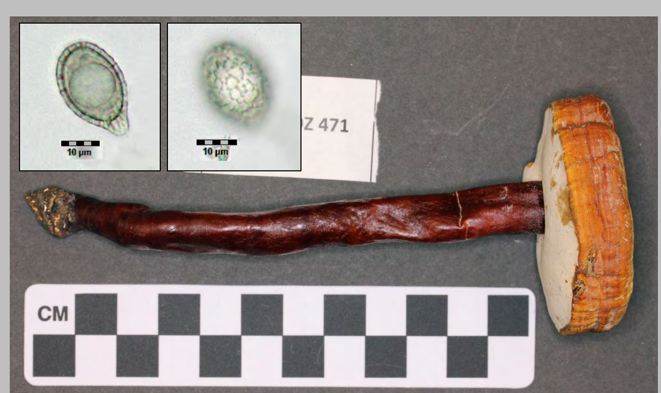
Humphreya eminii (Basidiomycota, Polyporales). A root pathogen. Inserts: (L) two different focal-level views of a basidiospore.

We are currently making determinations of these and will publish our results in the form of a checklist. Voucher specimens will be deposited at the Biodiversity Collection at the E. O. Wilson Biodiversity Laboratory at GNP, the Herbarium of Eduardo Mondlane University in Maputo (LMU), the Farlow Herbarium (FH) at Harvard University and the University of Illinois Herbarium (ILL).