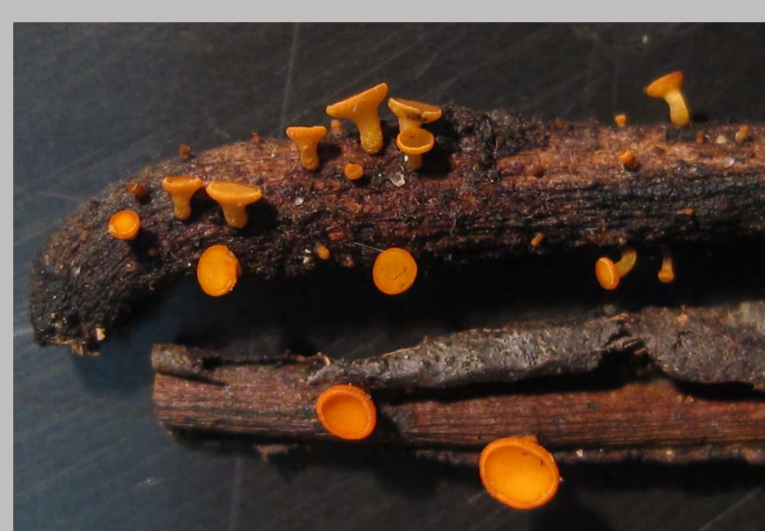
Dicephalospora rufocornea (Ascomycota, Helotiales). On mid-veins and petioles of well-rotted leaves.