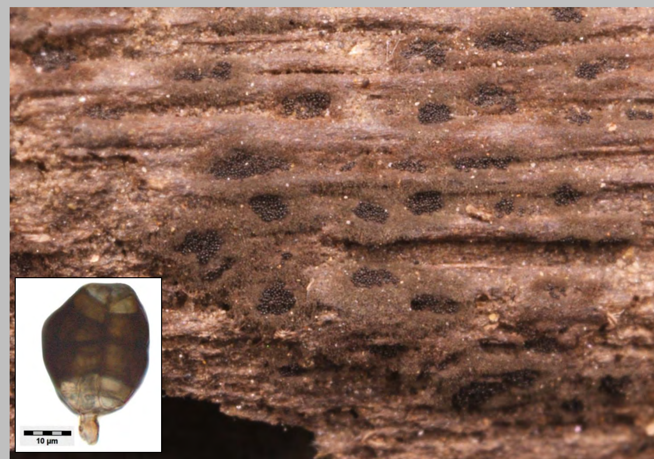
Hermatomyces reticulatus (Ascomycota, Pleosporales) on rotten wood. Insert: conidium. Sexual morph unknown.