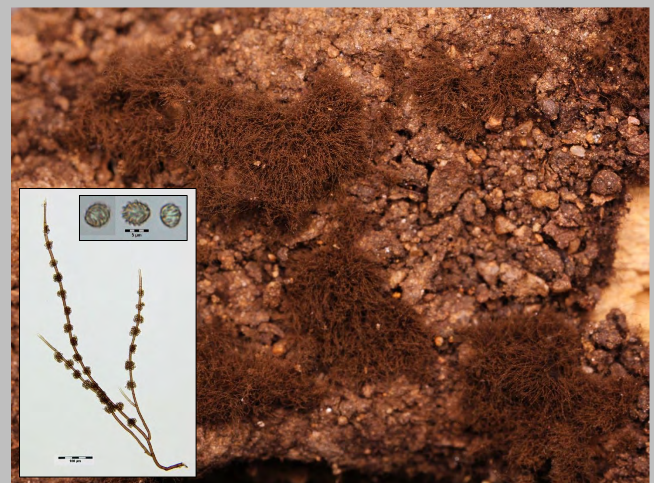
Kumanasamuha sundara (Ascomycota, Pezizales). Teleomorph referable to Trichaleurina . On rotted wood. Insert: conidiophore with whorls of "conidiophore initials" that give rise to conidigenous cells; conidia (upper right).