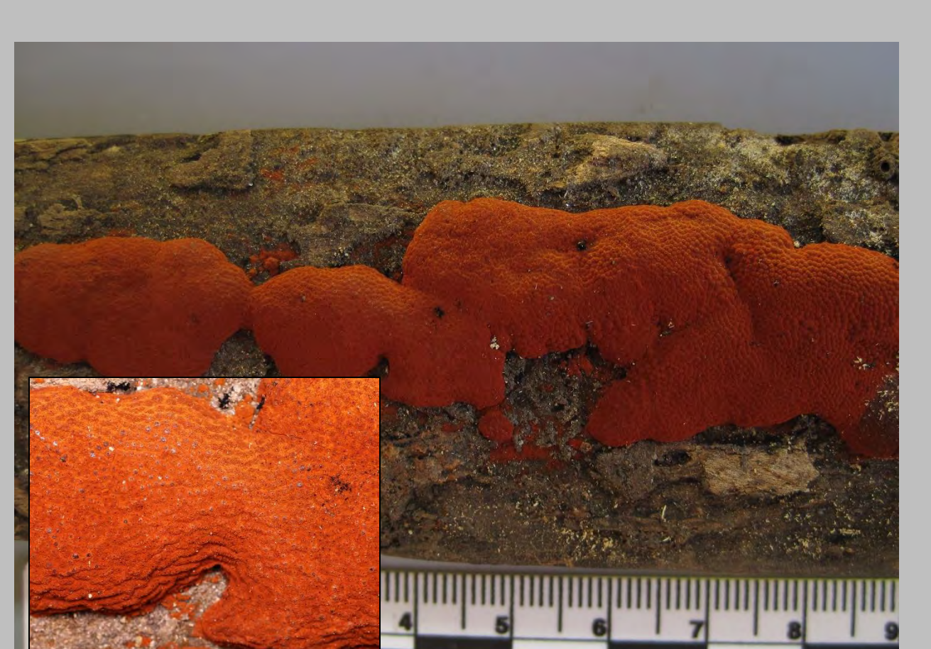
Hypoxylon haematostroma (Ascomycota, Xylariales). Ubiquitous on rotten wood. Insert: detail of stroma showing ostioles of perithecia.

Funding: Ella Lyman Cabot Trust. cabottrust.org.