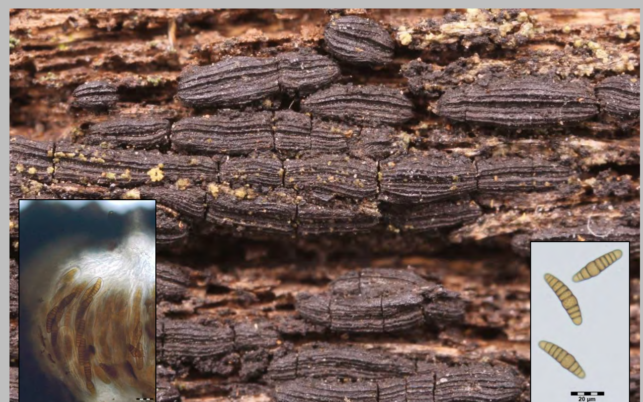
Oedohysterium sinense (Ascomycota, Hysteriales). Inserts: (L) longitudinal section of an ascoma, detail of centrum; (R) ascospores.

We conducted a fungal survey of GNP in June-July of 2016. Our survey was conducted in the beginning of the dry season and our collections represent species in fruit during a season that is not often sampled. We collected voucher specimens at random localities and habitats within the Park, focusing on discomycetes, polypores and anamorphic fungi. Despite a severe drought that had affected the region that year, we made over 500 collections.