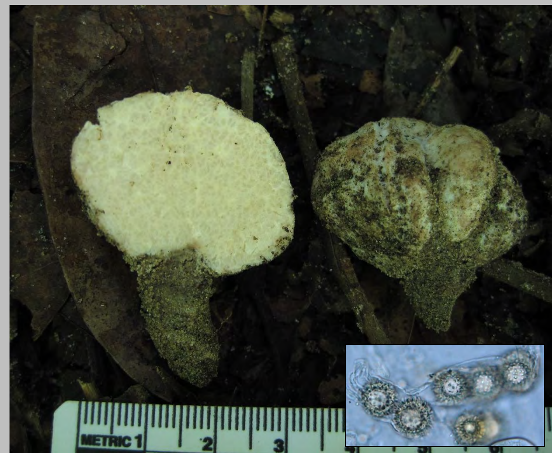
Eremiomyces echinulatus (Ascomycota, Pezizales), a semi-hypogeous truffle. Insert: ascospores.