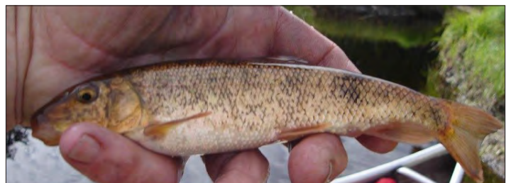
Figure 2. Oswegatchie River tributary in St. Lawrence County with Summer Sucker in running ripe condition, male, on rock May 27, 2014, and with female running ripe with eggs on June 7, 2009.