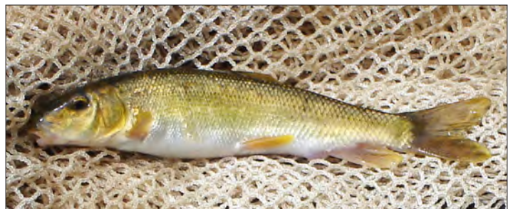
Figure 1. Summer Sucker from a headwater pond in Hamilton County on June 20, 2007, female in spawning condition.

Mather's other collection of late-spawning, small suckers is from Minnow Pond near Blue Mountain Lake, located in the central Adirondack Mountains. Current evidence suggests that this collection is part of a lineage of suckers now best known from locations 60 miles east in Elk Lake (Figure 3), in a small pond 2.5 mi east in Hamilton County, and in a small pond 40 miles northeast