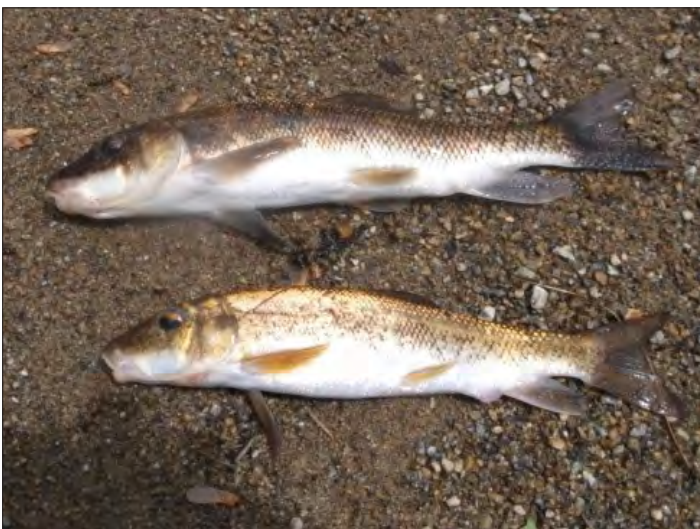
Figure 4. Elk Lake Suckers in spawning condition with tubercles, male above and female below.