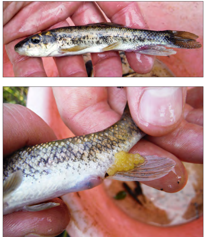
Figure 5. Spawning Elk Lake Suckers with tubercles (male, top, and female) caught in tributary of a mountain pond in Essex County on June 17, 2014.

Spawning time is a key factor in identifying Summer and Elk Lake suckers. White Sucker in these mountain ponds usu-