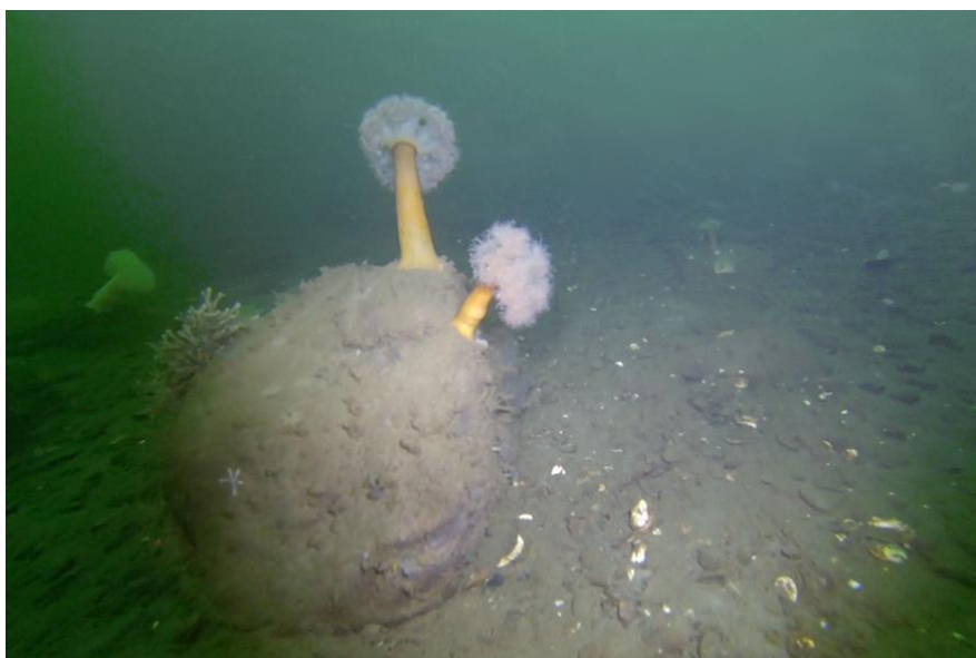
Metridium senile growing attached to a rock on mixed substrate

Metridium senile is an anemone which lives attached to any suitable hard substratum as pier piles and rock faces down to 100m's depth. It is found in overhangs, caves and beneath boulders (Hiscock & Wilson 2007).