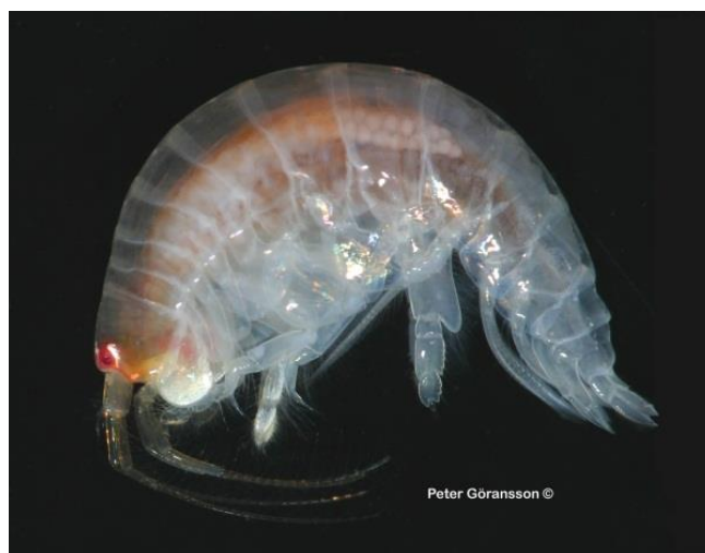
Haploops tubicola female.

The main distribution of H. tubicola within the HELCOM area is in the Kattegat and Öresund, but there are also sites in the Great Belt. The species is reported also from the Skagerrak and the North Sea. Regular monitoring performed by Helsingborg municipality in the Swedish part of the Sound shows a continuous decline of the Haploops community since more than ten years. In 2012, almost no animals were found at all. There is also a decline in the Skagerrak. The reason for the decline is, however, still unknown. Perhaps eutrophication in combination with increased water temperature plays a role, but this is yet to be proven. Elsewhere the species is found in the Arctic Ocean where it is circumpolar, in the North Pacific, North Atlantic, as well as the Atlantic coast of Europe from Norway to Mediterranean and the Adriatic.