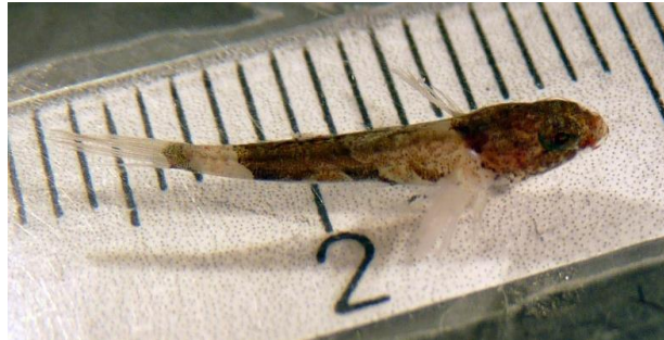
Diminutive goby. The distance between scale marks is 1 mm.