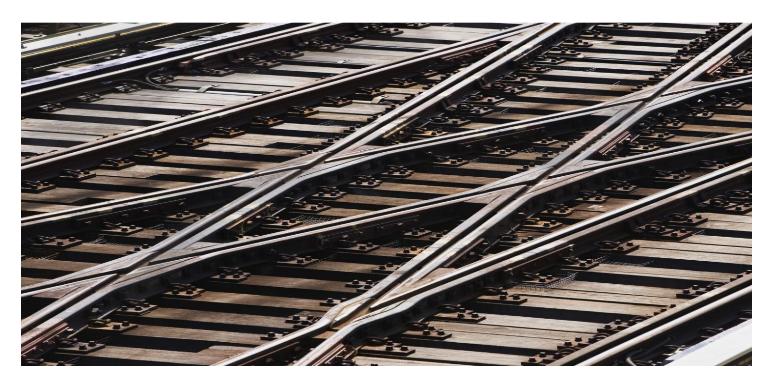
SAP Transportation Management