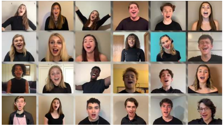
Students perform during Virtually Together