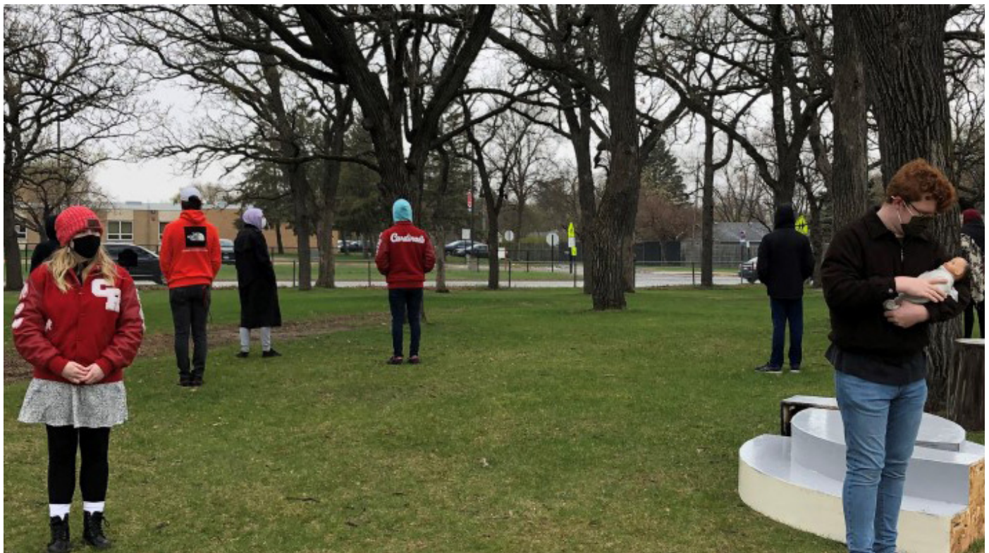
Coon Rapids High School students rehearse for an outdoor production of Into the Woods .