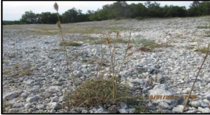
Figure 1. Agropyron pinifolium (=ibreli ayrık) in its habitat