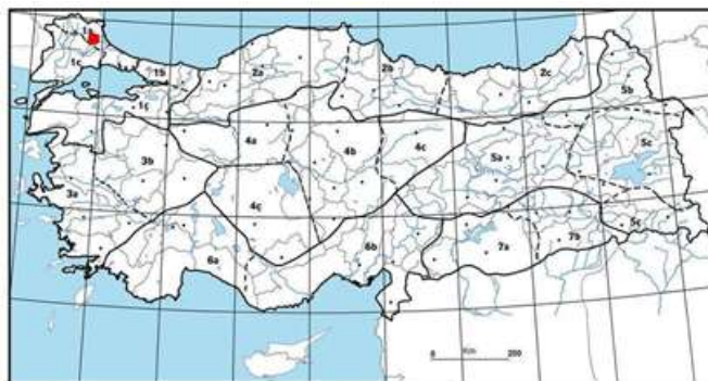
Figure 3. The distribution map of Agropyron pinifolium (●) in Turkey