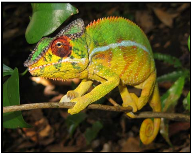
FIGURE 3. The chameleon Furcifer pardalis , commonly encountered throughout the massif Montagne des Français in northern Madagascar, including the mangrove system.