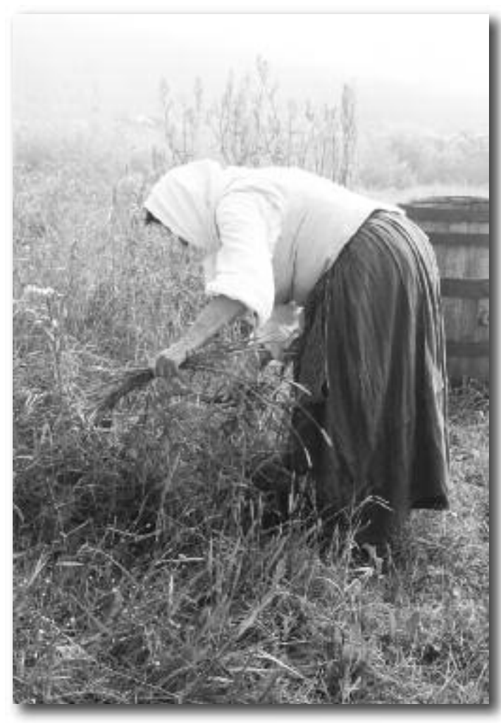
"I was once reaping on a field with a crew of nimble lads. I threw of my jacket and passed them by."

From the time the forest was felled with an axe, until a crop was brought to the point of harvest, the amount of labour was immense. Certainly, neighbours were close to each other. They frequently held plowing and reaping frolics; they used the sickle and the scythe. There was a bard in these parts called Allan son of Hugh (MacEachern.) He was once at a reaping frolic and he made a verse of song to incite the others. It goes like this: