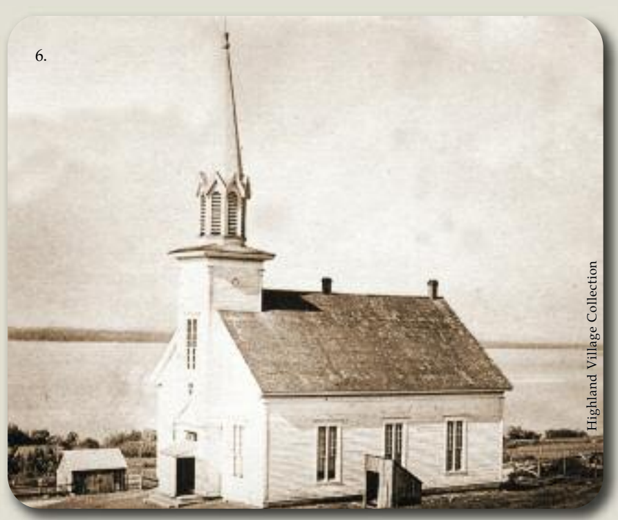
1) S.S. Enterprise passing through the Grand Narrows train bridge, 1930's; 2) Winter in Iona, 1920's; 3) UNESCO Man and the Biosphere Programme certificate 4) The Barra Strait and Hector's Point from Grand Narrows,1901; 5) The train in Jamesville as it heads trowards Iona; 6) The Malagawatch Church over looking the River Denys Basin; 7) The plasters in Iona; 8) Sailing on the lake, 1930's; 9) Kidston Island in Baddeck, 1935; 10) St. Columba Church Iona.