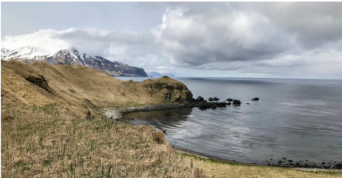
View of the coast of Adak near the LORAN station