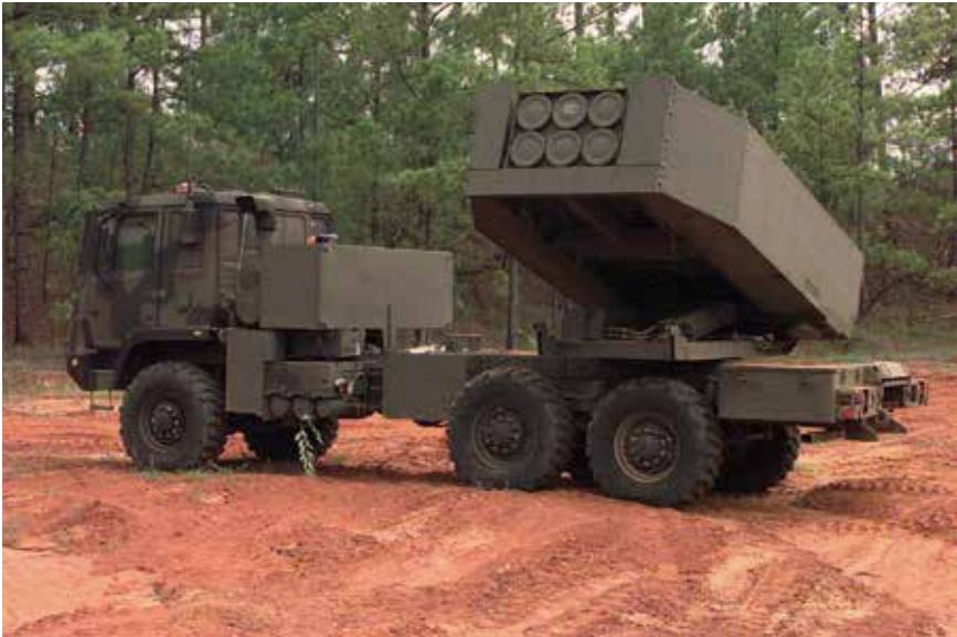
A High-Mobility Artillery Rocket System

fire the same family of rockets as the tracked Multiple-Launch Rocket System (MLRS), but carries only one pod of six rockets instead of the two pods found on the MLRS. In January, the second low-rate production contract was signed for twenty-six systems, one of which was for the Marine Corps. Total acquisition is expected to be over 800 launchers for the Army and 40 launchers for the Marine Corps. The Army conducted the initial operational test for HIMARS in two phases. The ground phase occurred at Fort Sill, Oklahoma, in September 2004, with a test platoon firing live missions with reduced-range practice rockets and exercising all aspects of fire missions. The flight phase will be conducted in early FY 2005 at White Sands Missile Range, New Mexico, where the HIMARS will fire basic and extended-range rockets, the Global Positioning System-guided rocket, and the Army Tactical Missile System missile. The first HIMARS battalion was expected to be fielded later in FY 2005.