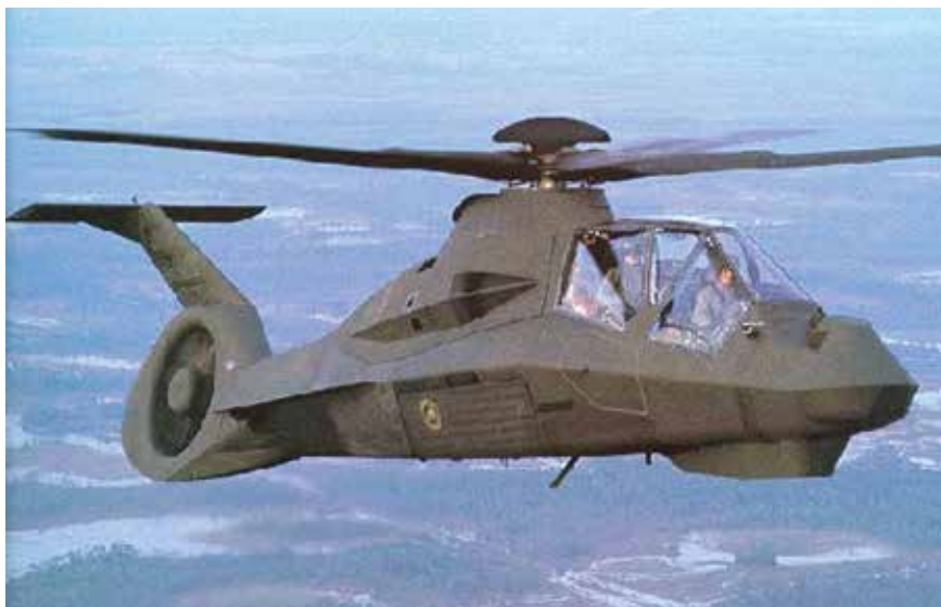
RAH-66 Comanche helicopter

During FY 2004, the Army restructured or canceled 126 programs to free resources for more pressing wartime requirements. The most significant of these decisions was the cancellation of the RAH-66 Comanche helicopter, an armed reconnaissance helicopter that the service had begun developing in 1983 as the Light Helicopter Family program. The decision to cancel the Comanche came out of a study on the restructuring of Army aviation that incorporated operational experience since 2001 and an analysis of threats in the foreseeable future. The study found that the unique capabilities of the Comanche (the helicopter was hard to observe and had on-board diagnostics) were not vital in either the current or foreseeable operational environments. Furthermore, the study affirmed the need to provide the most effective survivability enhancements to rotary- and fixed-wing aircraft as soon as possible; to upgrade, modernize, and rebuild the attack, utility, and cargo helicopter fleets; and to replace the light observation and scout/attack helicopter fleet as rapidly as possible.