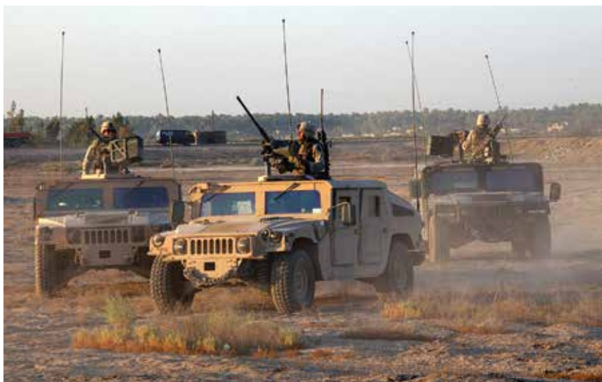
M1114 High-Mobility Multipurpose Wheeled Vehicles

units, such as field artillery, that had been assigned maneuver-type missions. Unfortunately, only the M1114 variant of the HMMWV had armor protection, and before the war, Army doctrine had given this variant only a small role in operations, so few units were equipped with this model and production lines could produce just thirty M1114s per month. As the use of IEDs increased over the summer of 2003, CJTF-7 began to submit requirements through the Joint Staff for armored wheeled vehicles. Those numbers increased rapidly during the fall of 2003, and the scope of this requirement was immense because by late 2003 the task force employed some 12,000 HMMWVs and 16,000 other wheeled vehicles.