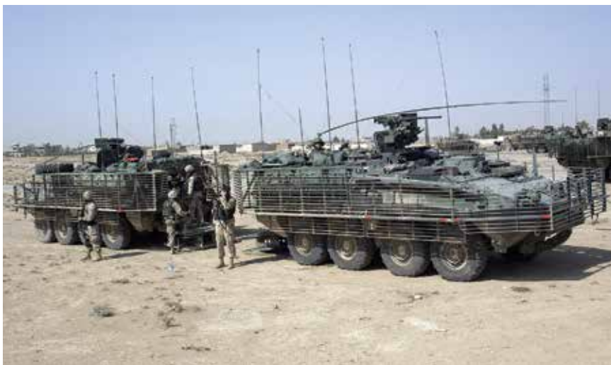
Stryker vehicles in Iraq

briefed General Schoomaker on various options, but he delayed a decision until after a blue ribbon panel, headed by former Chief of Staff Gordon R. Sullivan, had examined the issue. The panel was expected to make its recommendations in January 2005.