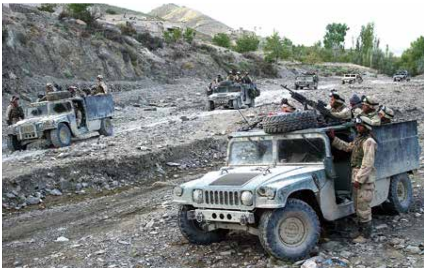
Soldiers of the 2d Battalion, 27th Infantry, 25th Infantry Division, pause on their way to a mission, Orgun-e, Afghanistan, April 2004.

MNF-I, while the III Corps commander took command of MNC-I. In July, General George W. Casey Jr., who had been serving as the vice chief of staff of the Army, relieved General Sanchez as the commander of MNF-I. Multi-National Security Transition Command–Iraq replaced the Office of Security Cooperation–Iraq in June 2004, although it then took several months for the new organization to develop its initial staffing requirements and to get them filled.