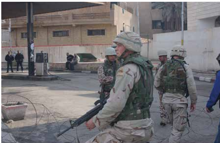
Soldiers of the 2d Battalion, 3d Field Artillery Regiment, 1st Armored Division, escort members of the Iraqi Civil Defense Corps security force to a fuel station in Baghdad.

The largest number of deployed Army forces in FY 2004 was committed to Operation IRAQI FREEDOM. At the end of FY 2003, a total of 152,815 soldiers were deployed on this operation; in September 2004, Army strength in the operation was 101,932. During the year, Combined Joint Task Force-7 (CJTF-7) conducted the first rotation of forces in that country as it transitioned from Operation IRAQI FREEDOM I to Operation IRAQI FREEDOM II. This rotation included both American and other coalition nations' units, and involved moving nearly 260,000 personnel and more than 50,000 pieces of equipment into and out of Iraq. Major Army combat units departing the country were the 1st Armored, 4th Infantry, 82d Airborne, and 101st Airborne Divisions; the 2d Armored Cavalry Regiment; the 173d Airborne Brigade; and the V Corps Artillery. In February 2004, the III Corps staff replaced the V Corps staff as the core of the CJTF-7 headquarters. Major Army combat units arriving during the rotation were the 1st Infantry and 1st Cavalry Divisions, along with the 2d Brigade, 10th Mountain Division; 2d Brigade, 25th Infantry Division; 3d Brigade, 2d Infantry Division; 30th Infantry Brigade; 39th Infantry Brigade; 81st Armored Brigade; and