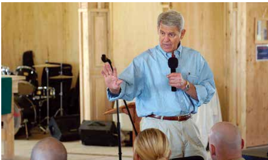
Acting Secretary of the Army Brownlee

Transformation underwent a significant shift in emphasis in its near- and mid-term focus during FY 2004. Before Operation IRAQI FREEDOM, the Army assumed greater risk in the current force by focusing its modernization efforts on creating the future force. The shift since the start of the Iraq war was based on operational necessity and the March 2004 strategic planning guidance issued by the Office of the Secretary of Defense. This shift will accelerate fielding available, next-generation capabilities to the current force for use in Iraq and Afghanistan instead of fielding them only with the future force. The Army Campaign Plan published in April sought to balance the resource commitments to sustained war fighting with transforming to meet future challenges.