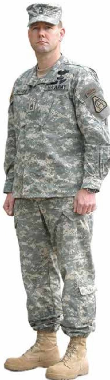
The new Army Combat Uniform

Uniform. Work on the ACU began in January 2003 and included field testing of prototypes in the United States and Iraq. The final version of the ACU included thirty-one significant changes from its predecessors, including wrinkle-free fabric, redesigned pockets, Velcro insignia instead of sew-on, and no-shine desert boots instead of black boots. The new uniform moved rank insignia from the collars to a chest tab and officers would not wear branch insignia. The ACU used a digital camouflage pattern that ends the need for separate woodland and desert camouflage pattern uniforms, and is effective in urban environments. The service intended to start fielding the ACU to every deploying soldier in the spring of 2005 and have all soldiers, including those in the reserve components, wearing it by December 2007.