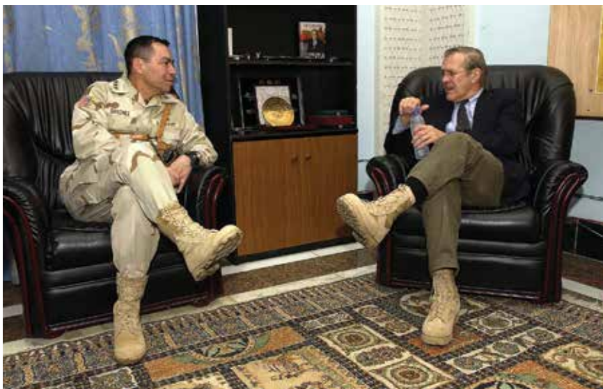
General Sanchez and Secretary of Defense Rumsfeld

In Iraq during FY 2004, a total of 428 soldiers were killed in action or died of wounds. Another 109 soldiers died from non-combat-related causes. The wounded numbered 4,277 soldiers.