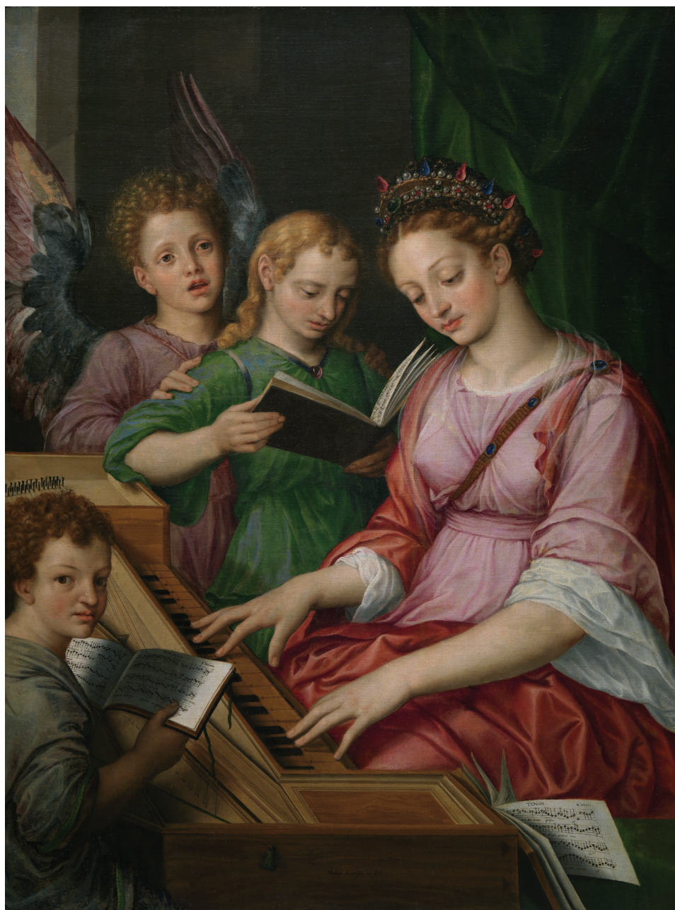
Michiel Coxie, Saint Cecilia . Museo Nacional del Prado, Madrid

In the exhibition Michiel Coxie. De Vlaamse Rafael . Museum M, Leuven, October 31, 2013 – February 23, 2014.