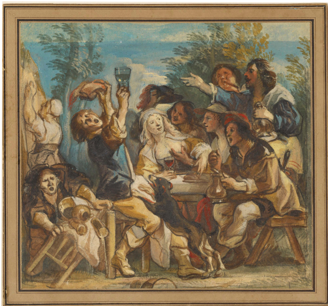
Jacob Jordaens, Merry Company , c. 1644. Watercolor over black chalk, heightened with white gouache, 21.9 x 23.8 cm. The J. Paul Getty Museum, Los Angeles.

Exhibited at The Getty Center, Los Angeles, October 14, 2014 – January 11, 2015.