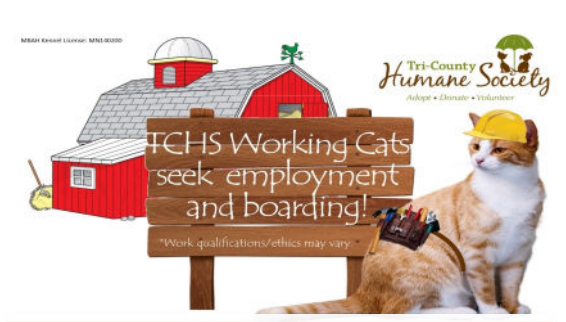
Tri-County Humane Society occasionally receives cats that do not make good indoor pets. These cats prefer earning their rent by assisting with pest control in barns or shops. All "working cats" are spayed/neutered and