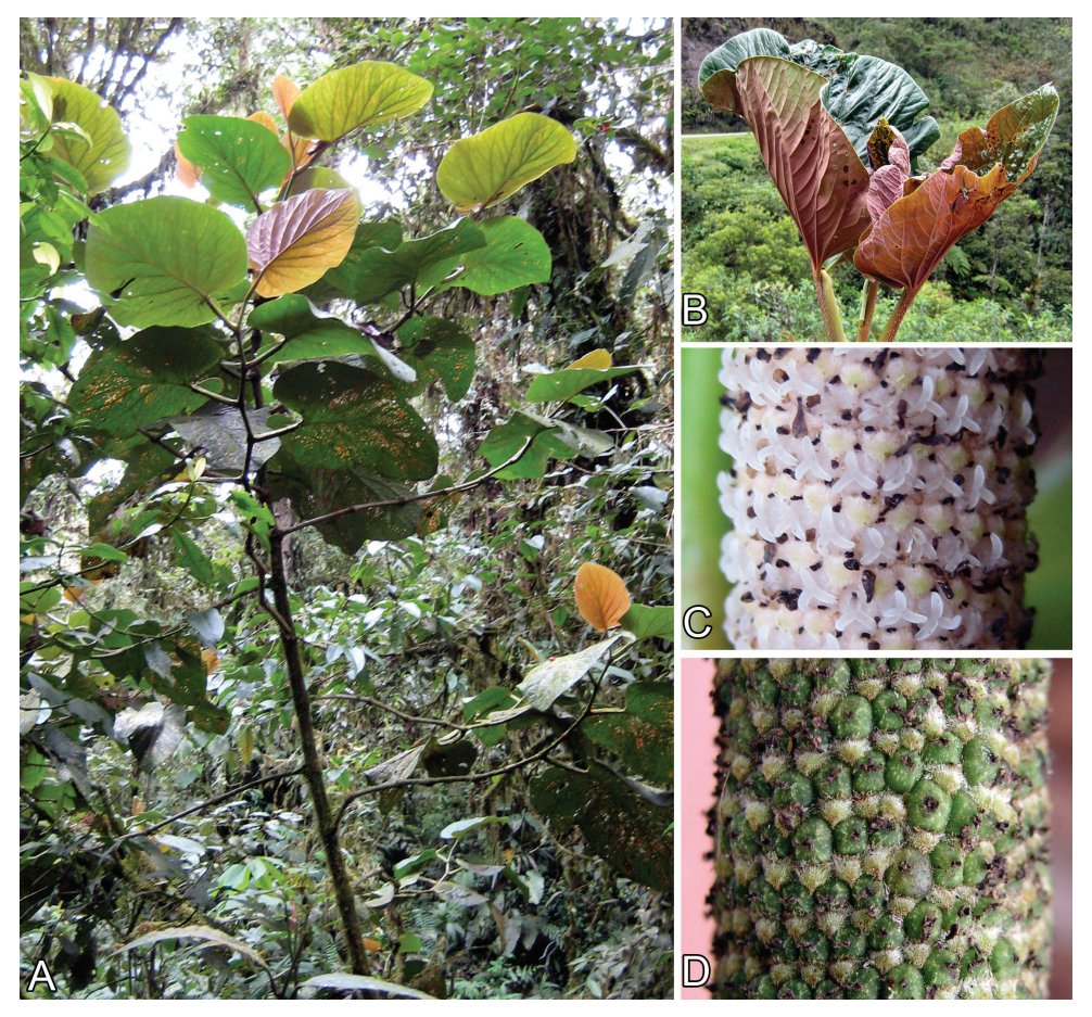
Figure 2. Piper kelleyi. A Habit B Close-up of leaves showing characteristic red color of younger leaves [Tepe et al. 2381] C Close-up of inflorescence [Tepe et al. 2615] D Close-up of infructescence [Tepe et al. 1597].

Piper kelleyi exhibits the third of these patterns. He established the herbarium (MESA) at Colorado Mesa University, Grand Junction, Colorado (CMU), and cultivated a high diversity of Piper species at the CMU greenhouse, including P. kelleyi . These plants are still used for research today.