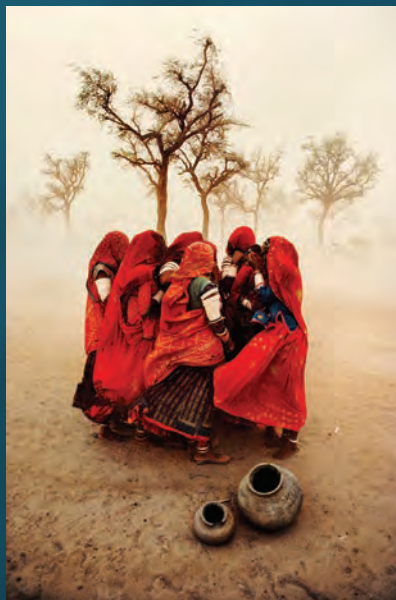
Steve McCurry, Dust Storm, Rajasthan , 1983