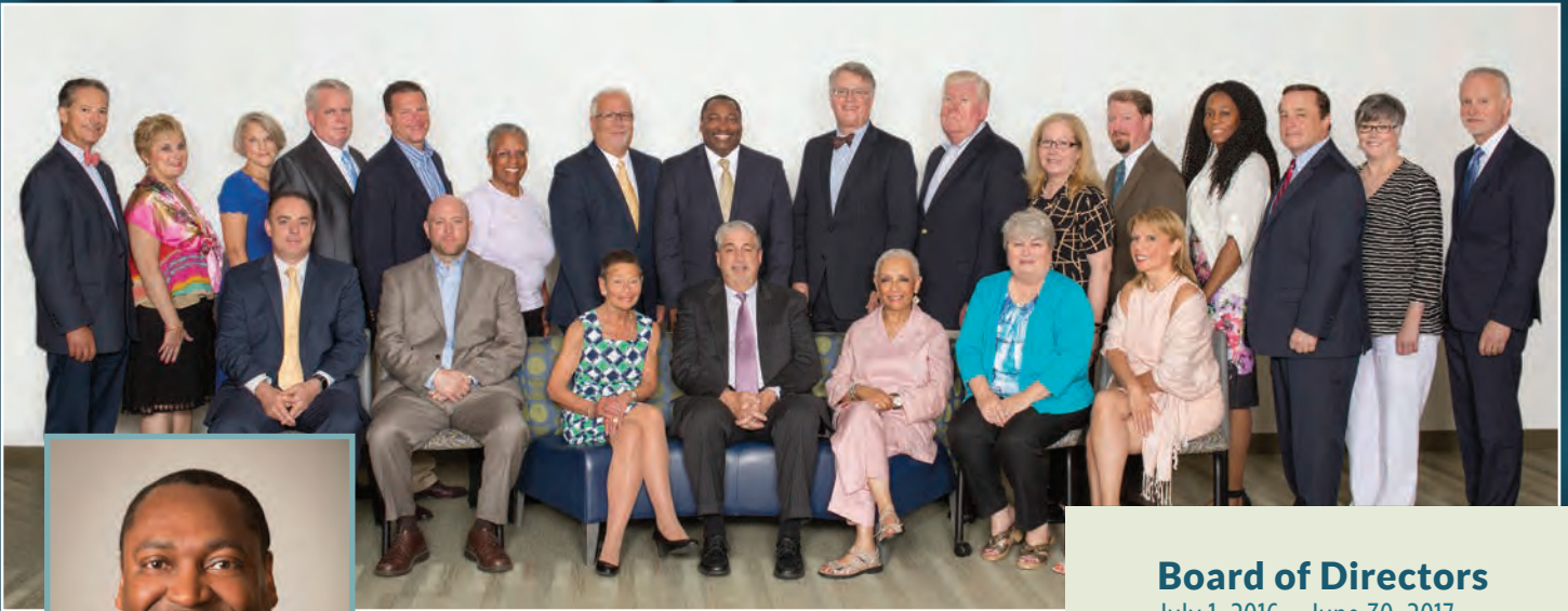
Members of the 2016-17 HCCF Board of Directors