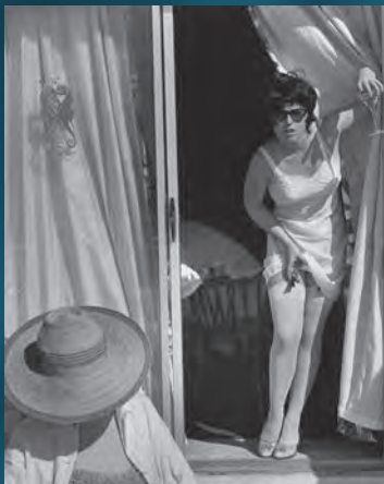
Untitled #7, Cindy Sherman

The 2016-2017 HMA exhibitions and programs have been made possible through the generous support of the Werth Family Foundation, Institute of Museum and Library Services, the National Endowment for the Arts, Fairfield County's Community Foundation, Voya Financial, and the Connecticut Architecture Foundation as well as generous gifts from individual donors.