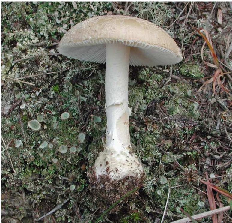
TOP: Rockburn Branch Park, 10/11/2011, GILLS and STALK: Daniels, PVSP, 7/13/2016, OVERALL: Rockburn Branch Park, 10/11/2011