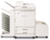
HP Color LaserJet 9500mfp with optional 8-bin mailbox

Colour printing and copying up to A3, scan-to-email, faxing 1 , document finishing, and optional digital sending 2 features for demanding workgroups and departments. Advanced technologies and HP supplies yield consistent, impressive colour quality.