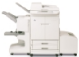
HP Color LaserJet 9500mfp, with optional multifunction finisher