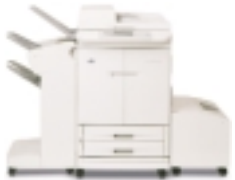
HP Color LaserJet 9500mfp, with optional stapler/stacker

Improve the efficiency of your business with in-house finishing and streamlined workflow.