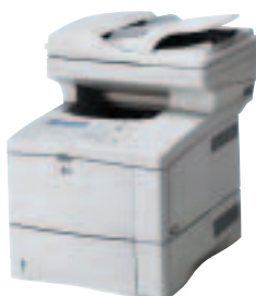
hp LaserJet 4100mfp