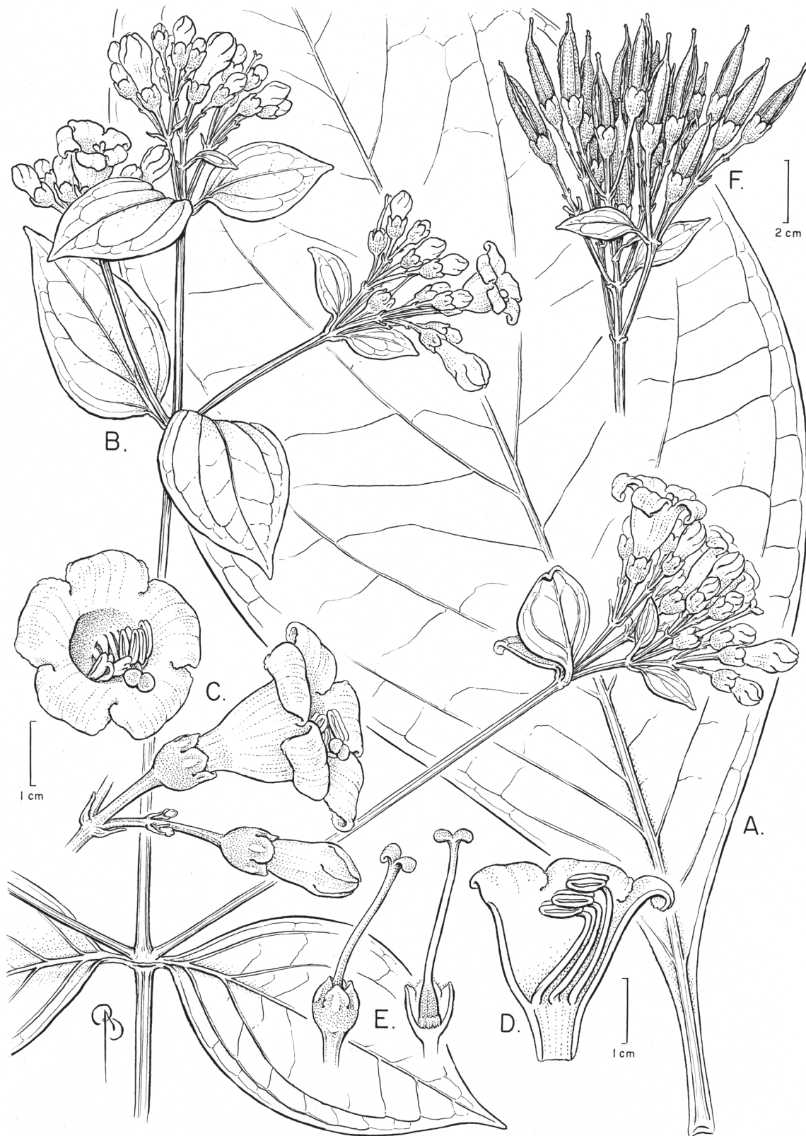
FIGURE 2. Macrocarpaea cortinae . A, lower leaf; B, habit of flowering stem; C, flower, face view, and flower and bud, side view; D, corolla l.s.; E, calyx and pistil, l.s. of same; F, infructescence. All drawn from Grant 5116 (unmounted specimens, pickles and photos).