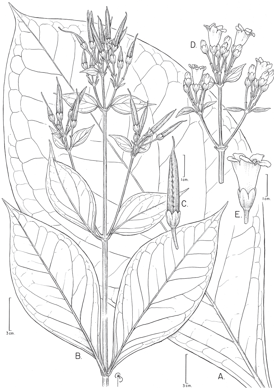
FIGURE 6. Macrocarpaea umbellata . A, leaf; B, habit of fruiting stem; C, fruit; D, flowering stem; E, flower. A–E drawn from Cuatrecasas 14986 (US), B–C from Madison et al. 4795 (F), and D–E from Croat 38605 (MO).