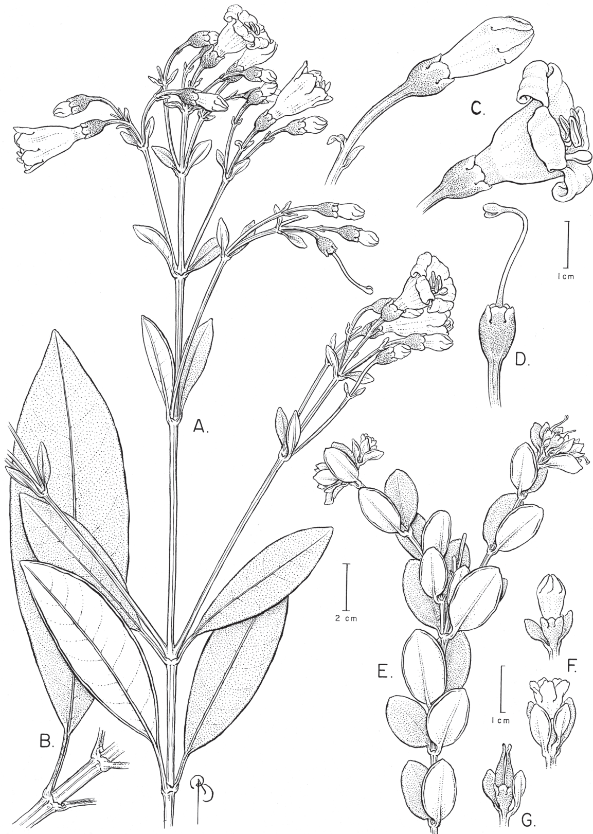
FIGURE 7. Macroparpaea harlingii (A–D) and M. stenophylla (E–G). A, habit of flowering stem; B, lower leaf; C, flower and bud, side view; D, pistil and calyx; E, habit; F, bud and flower with bracts; G, capsule with bracts. A–D from Grant 4669 (pickles and 2 sheets), E–F from Neill & Quizhpe 16113 (unmounted specimen), G from Neill & Kajekai 16910 (MO).