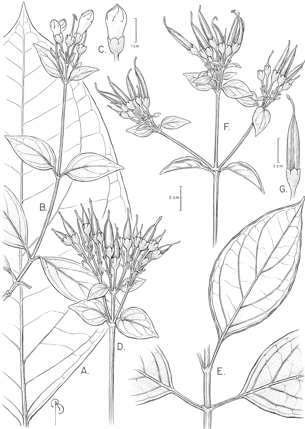
FIGURE 1. Macrocarpaea pacifica (A–D) and M. catherineae (E–G). A, lower leaf; B, flowering stem; C, bud; D, fruiting stem; E, lower leaves; F, fruiting stem; G, capsule. A–D drawn from Grant 4704 (3 unmounted sheets), E–G from Grant 4695 (unmounted specimens).