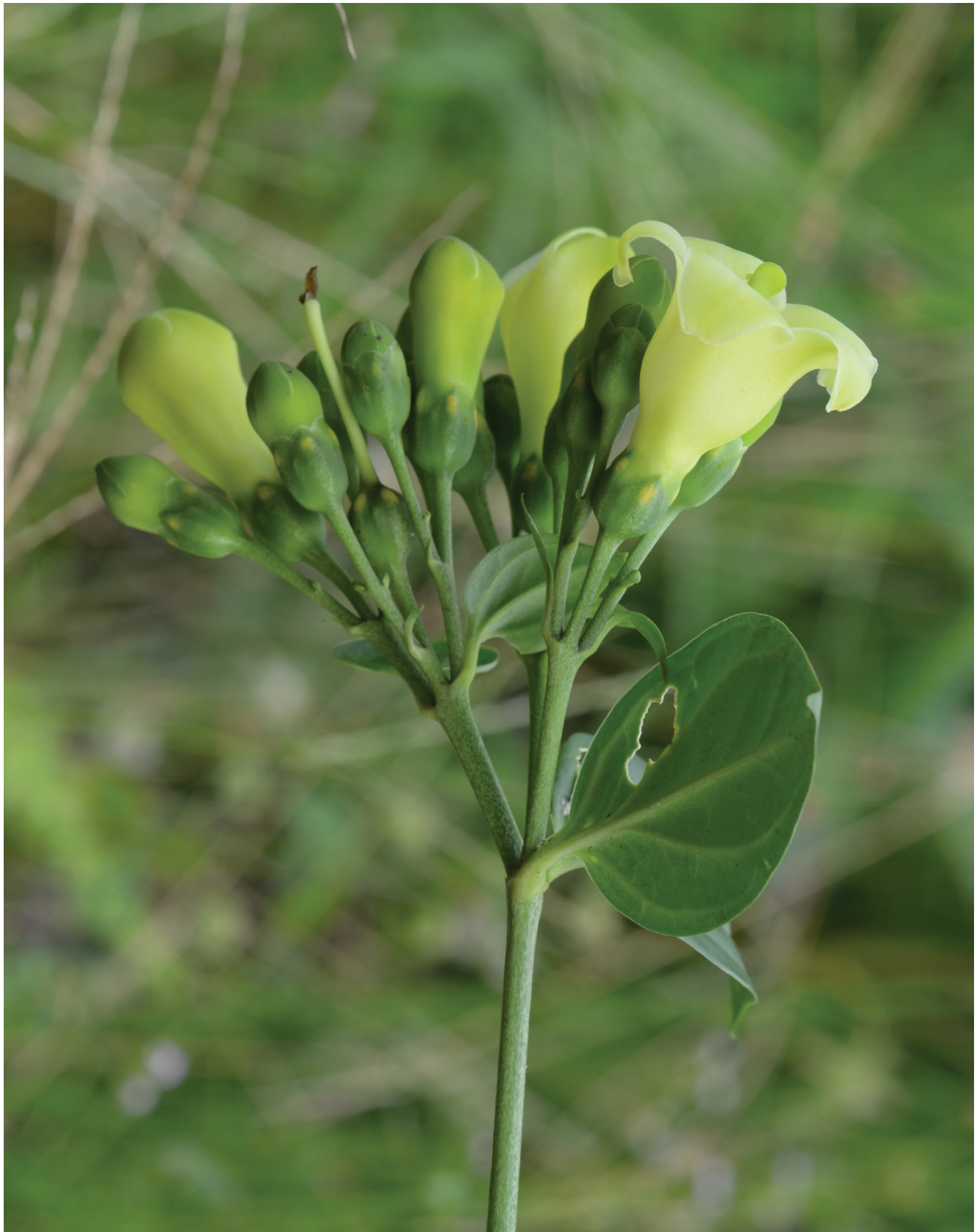
FIGURE 4. Macrocarpaea cortinae . Branch of the inflorescence, notice orange coloration on the dorsal portion of each calyx lobe.