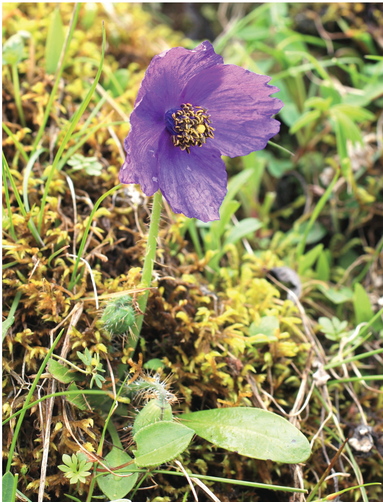
FIGURE 7. Meconopsis pulchella T. Yoshida, H. Sun & D. E. Boufford var. melananthera T. Yoshida at the type locality. Photograph by T. Yoshida, June 16, 2017.