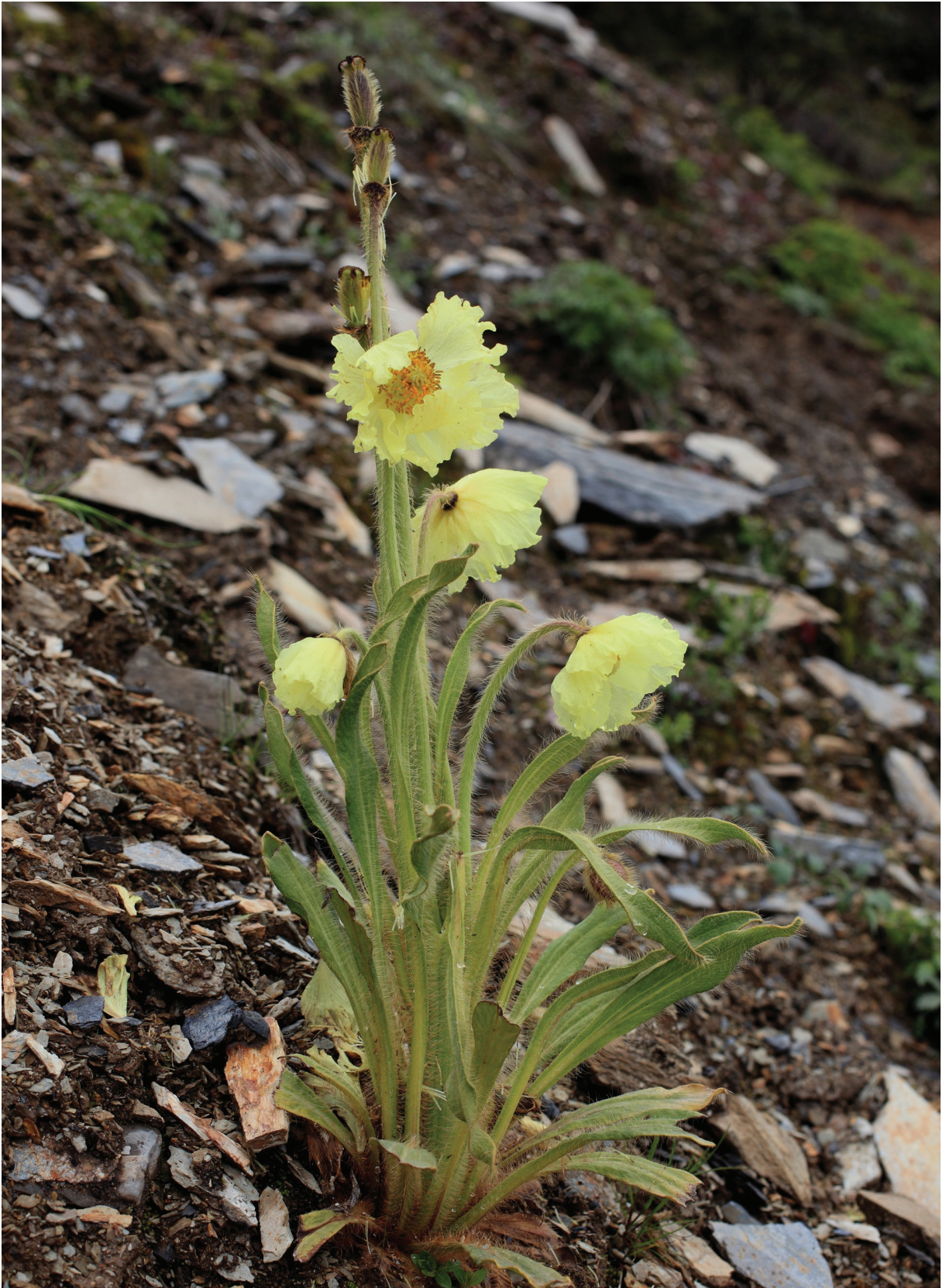
FIGURE 1. Meconopsis wanbaensis T. Yoshida at the type locality. Photograph by T. Yoshida, June 16, 2017.