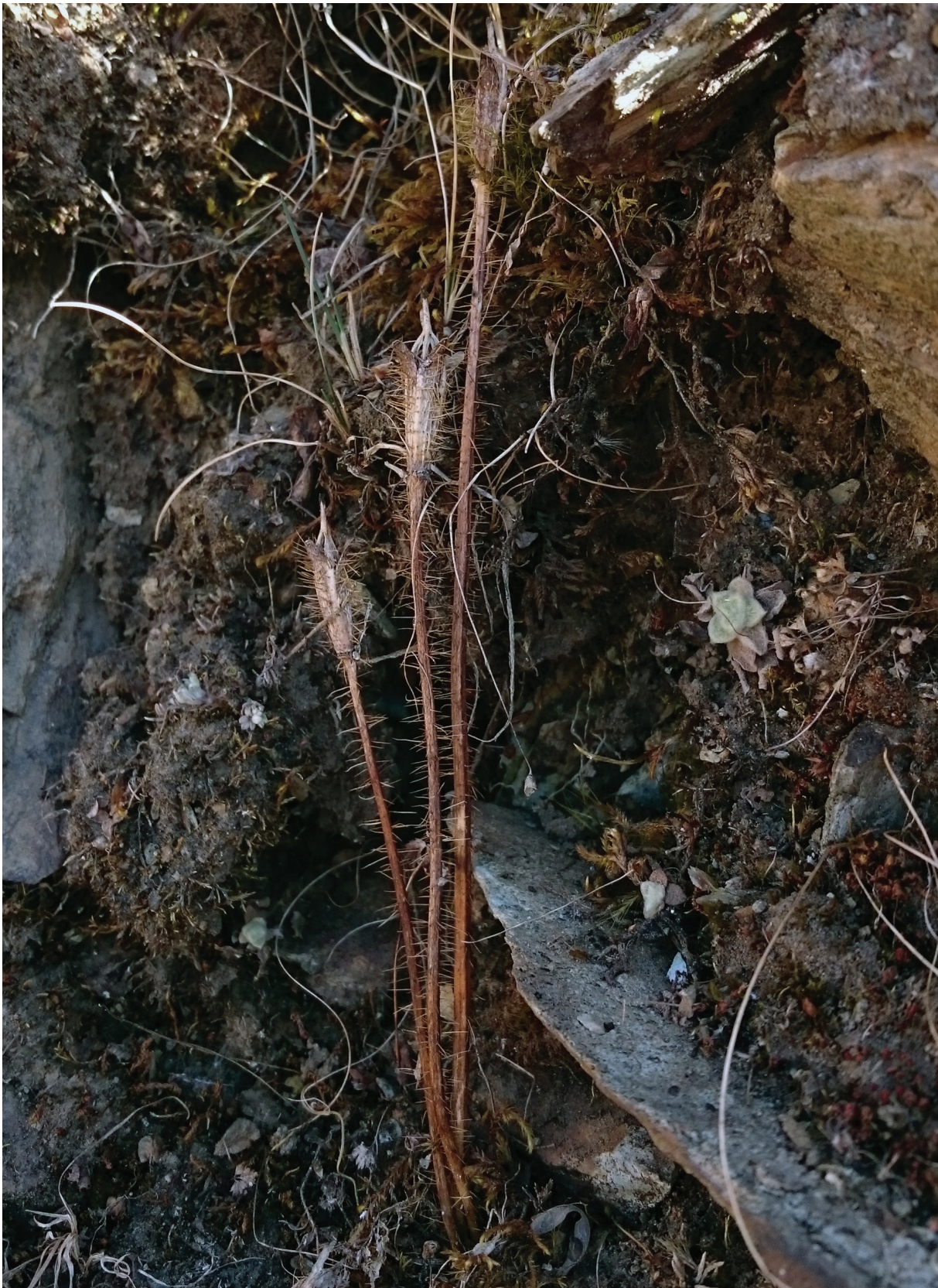
FIGURE 10. Meconopsis pulchella T. Yoshida, H. Sun & D. E. Boufford var. melananthera T. Yoshida at the type locality. February 4, 2017.