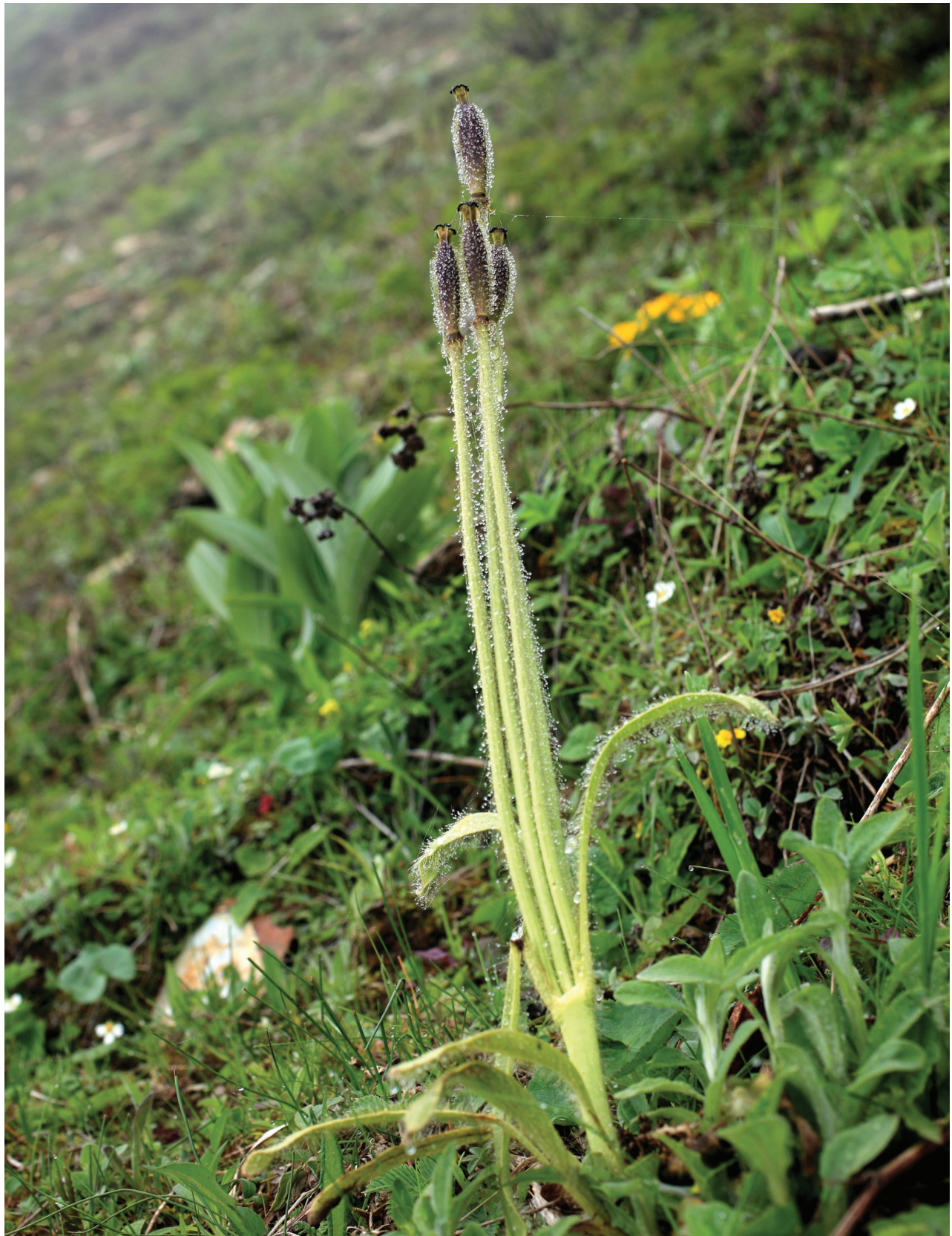
FIGURE 5. Fructing plant of Meconopsis wanbaensis T. Yoshida at the type locality. Photograph by T. Yoshida, June 17, 2017.