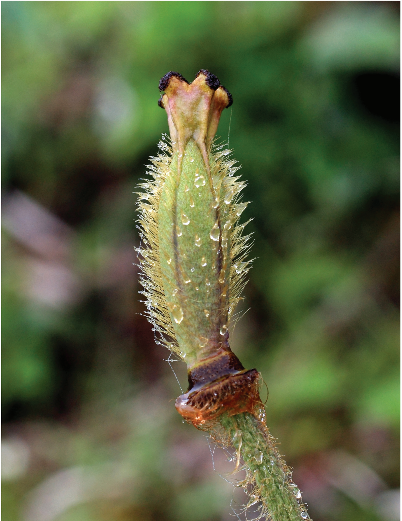
FIGURE 6. Young fruit of Meconopsis wanbaensis T. Yoshida at the type locality. Photograph by T. Yoshida, June 17, 2017.