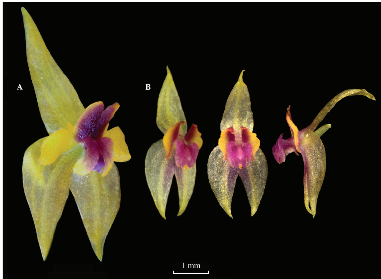
FIGURE 2. Comparison of flowers in Lepanthes cuspidata Luer and L. osaensis Chinchilla, Aguilar and Bogarín. A , Lepanthes cuspidata , oblique view; B , L. osaensis , oblique and frontal view, and lateral view with the dorsal sepal removed.

Plant epiphytic, caespitose, erect, up to 3.5 cm tall. Roots slender, flexuous, up to 3.4 cm long, 0.6 mm in diam.