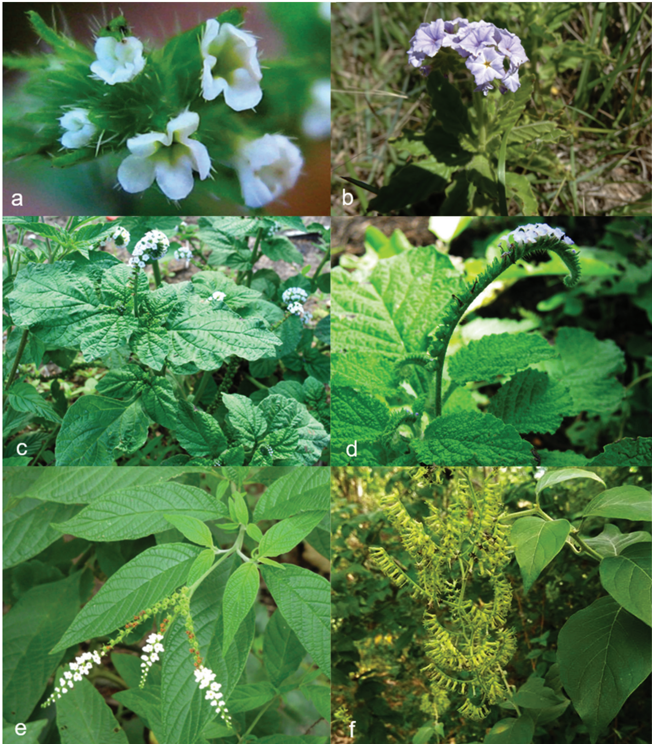
FIGURE 3. Species of Heliotropiaceae from Uruguay. A , Euploca procumbens (Mill.) Diane & Hilger; B , Heliotropium amplexicaule Vahl; C , H. elongatum (Lehm.) I.M. Johnst.; D , H. indicum L.; E , H. transalpinum Vell.; F , Myriopus paniculatus (Cham.) Feuillet.