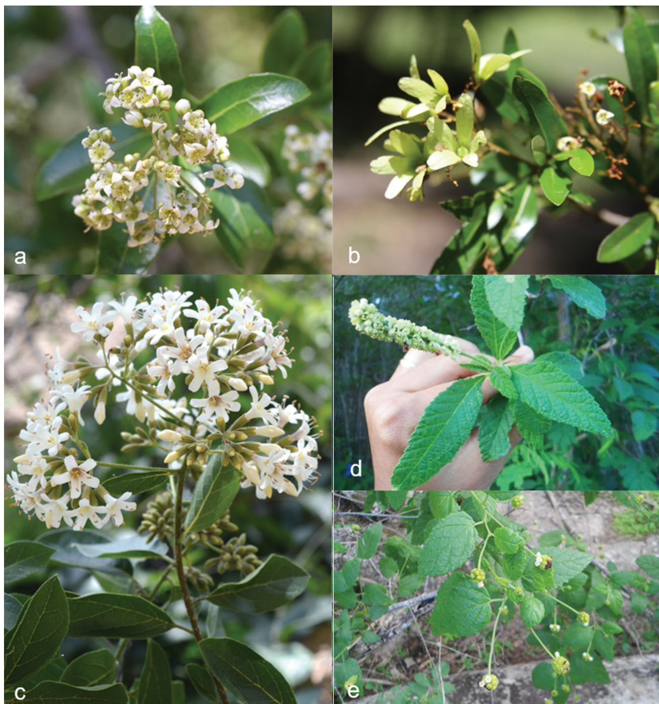
FIGURE 2. Species of Cordiaceae from Uruguay. A–B , Cordia americana (L.) Gottschling & J.S. Mill.; C , C. trichotoma (Vell.) Arráb. ex Steud.; D , Varronia curassavica Jacq.; E , V. polycephala Lam.