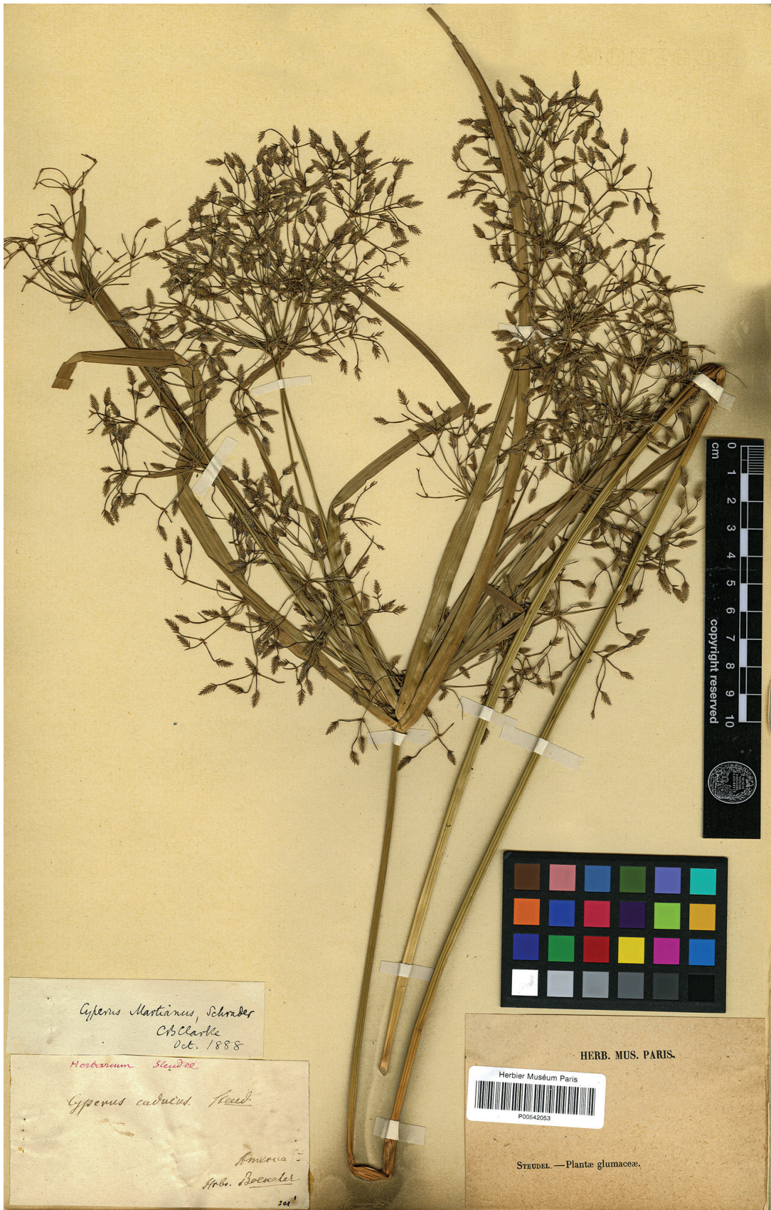
FIGURE 1. Holotype of Cyperus caducus Steudel.