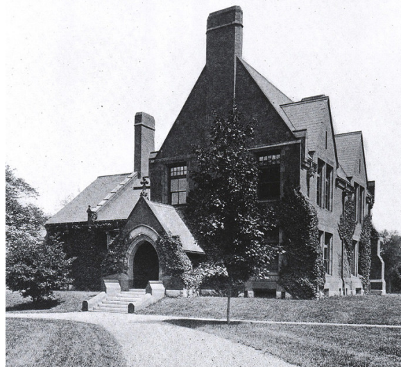
Farlow Herbarium, circa 1923

Now I am very gloomy. There appears to be no money to fit up my laboratory and I will not pay for it myself. It is enough that I give what I made out of my Lowell course to provide cases for the Tuckerman collection and other plants and I am not going to spend any more in fitting up a class laboratory. If the college cannot give that they can go without.