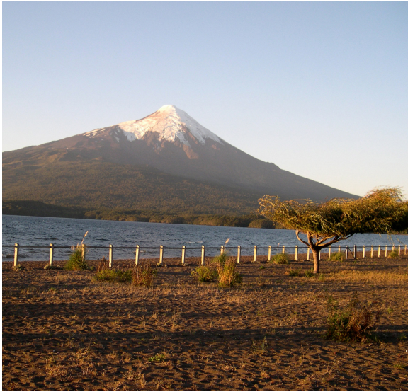
Figure 7. The sunset provides a pinkish glow to snow-capped Volcan Osorno and shimmering Lago Llanquihue. The road to a local ski area provided access to prime collecting sites in Nothofagus forests at the edge of the Parque Nacional Perez Rosales.

The gradient of moisture and temperature between these two sites is similar to that along the western USA as you travel from San Diego, California to Portland, Oregon. The climatic gradient between our two collecting locations allowed us to detect a wider diversity of fungi than if we had collected in only one location and it also provided insight into the broader biogeographic patterns of Patagonian fungi.