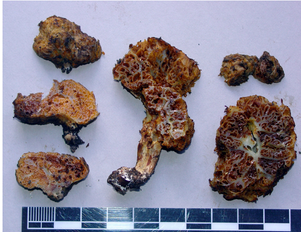
Figure 8. Gymnopaxillus morchelliformis Horak, an odd looking South American endemic. This collection (MES163) included a range of stipe sizes but all individuals had the characteristic “brainlike” appearance and cartilaginous veins. This species is locally abundant at some sites near Punta Arenas.

Perhaps the oddest fungus that we collected during our time in Chile was the enigmatic, truffle-like fungus Gymnopaxillus morchelliformis (Figure 8). I had never seen anything quite like this fungus in the Northern Hemisphere – it seemed like some sort of possessed morel! Gymnopaxillus was first described from Argentina (Horak & Moser, 1965) but a recent study described two additional species from Australia (Claridge et al., 2001), indicating that this genus is well distributed in the Southern Hemisphere. Despite its odd morphology, G. morchelliformis is actually a close cousin of Austropaxillus , one of the most common mushroom genera in Chilean Nothofagus forests.