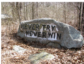
One of many Babson Boulders.