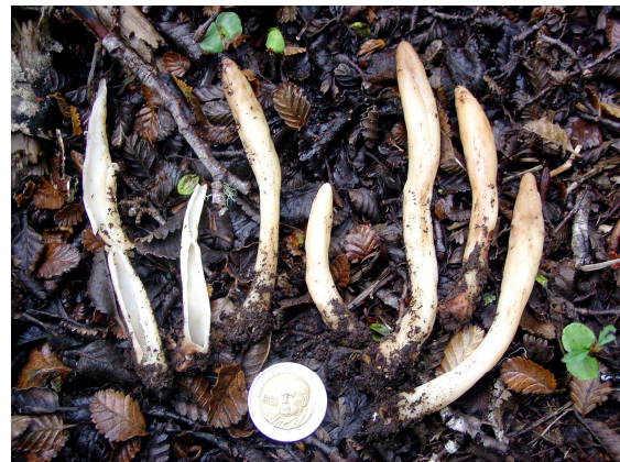
Figure 9. Underwoodia singeri Gamundí & Horak is an odd relative of Helvella that is found only in Patagonian forests. It often fruits completely below the ground but occasionally its viscid tip emerges above the leaf litter. Thaxter referred to it as “Geodon” (the “Earth Tooth”) – a very appropriate name!

As I said before, Don and I were also especially keen to re-collect some of Thaxter’s Pezizales species. The reason we were interested in pezizalean fungi was three-fold: 1) Don is one of the world authorities on the order Pezizales, 2) relatively few Pezizales have been described from South America (including only a single pezizalean truffle, Hydnocystis singeri ) and 3) Thaxter’s diary discussed several odd fungi that we wanted to see for ourselves. With a lot of raking and a little luck, we were finally able to locate two of these interesting fungi!