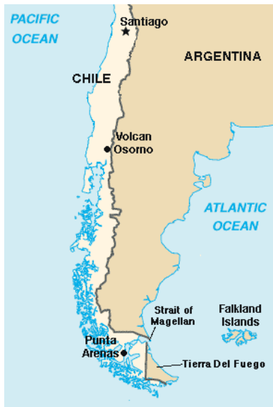
Figure 1. Map of South America showing the southern portions of Chile and Argentina.

European explorers first sailed their boats through the Strait of Magellan in 1520. This narrow windswept passage at the southern tip of South America later became a superhighway for human ships and cargo, first wooden sailing vessels, then guilded coal-powered steamers and finally modern