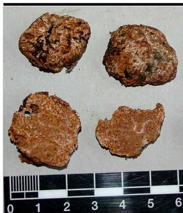
Figure 3. Gautieria chilensis Zeller & Dodge, one of two Gautieria species described from the Southern Hemisphere. This collection (MES131) was found in Punta Arenas.

and the majority of truffle species are known from the world's other Mediterranean regions: 1) Mediterranean Europe and North Africa, 2) California and the Pacific Northwest and 3) Southeastern Australia. The other Mediterranean region, South Africa, lacks suitable ectomycorrhizal host plants and therefore appears depauperate in hypogeous fungi.