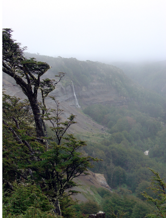
Figure 6. A waterfall tumbles into the steep canyon and joins the Río de las Minas near Punta Arenas, Chile. Roland Thaxter's diary describes his collections from this canyon bordered by Nothofagus forests. Today the watershed is protected as part of the Reserva Nacional Magallanes. The bent Nothofagus tree in the foreground is evidence of the strong winds that scour the area.

This strategy of collecting in two disparate locations worked out quite well because Punta Arenas and the Volcan Osorno area have very different climates – but both locations had a plethora of interesting fungi!