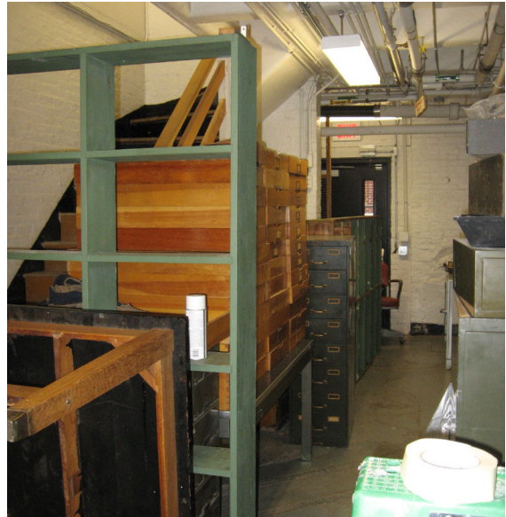
Farlow basement hall as staging area during major renovations.