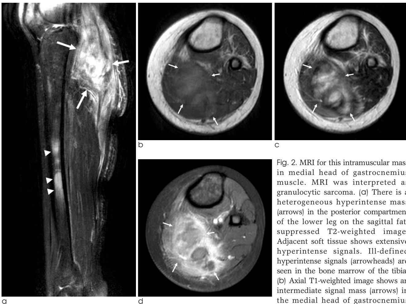
Fig. 2. MRI for this intramuscular mass in medial head of gastrocnemius muscle. MRI was interpreted as granulocytic sarcoma. (a) There is a heterogeneous hyperintense mass (arrows) in the posterior compartment of the lower leg on the sagittal fat-suppressed T2-weighted image. Adjacent soft tissue shows extensive hyperintense signals. Ill-defined hyperintense signals (arrowheads) are seen in the bone marrow of the tibia. (b) Axial T1-weighted image shows an intermediate signal mass (arrows) in the medial head of gastrocnemius muscle. (c) The mass (arrows) is heterogeneously mildly hyperintense on axial T2-weighted image. Ill-defined, hyperintense signal is seen in the adjacent muscle. (d) On contrast-enhanced fat-suppressed T1-weighted image, it shows peripheral, thick, irregular contrast enhancement with central non-enhancing areas (arrows).