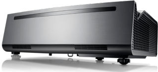
DELL ADVANCED 4K LASER PROJECTOR: S718QL