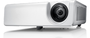
DELL ADVANCED LASER PROJECTOR: S518WL