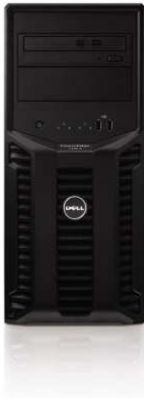
Figure 2. Front-Panel View

Figure 2 shows the front-panel view of the PowerEdge T110 II.