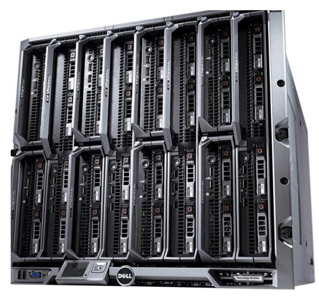
Figure 1. PowerEdge M1000e

The PowerEdge M610x is a full-height blade server that requires an M1000e chassis to operate.