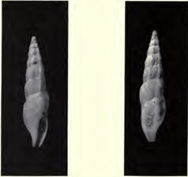
FIG. 42. Ithycythara hyperlepta sp. nov. C.N.H.M. no. 43963, type. Front and back views of shell. All about \times 6 .

Description of type .—Shell elongate, very slender, subsolid, whitish brown with a waxy gloss. Whorls 10, the earlier ones with