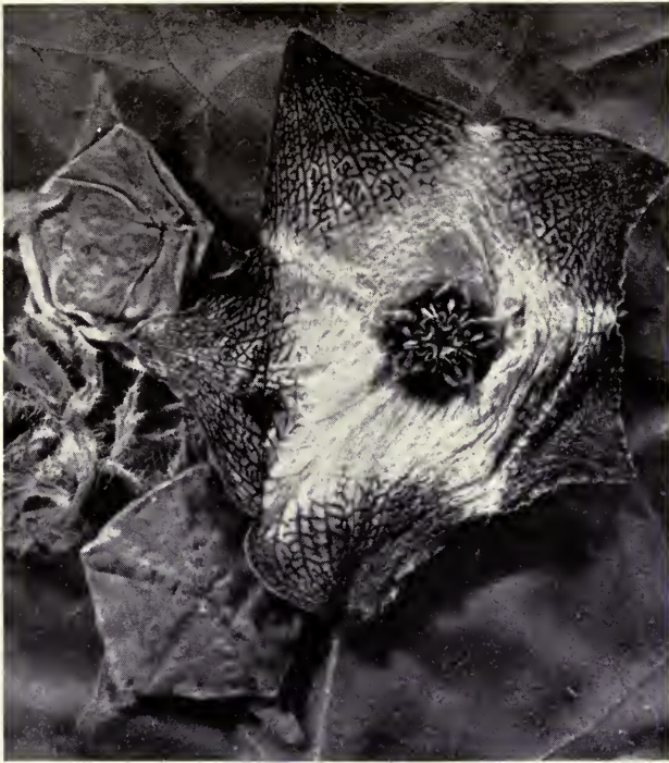
FIG. 2. Matelea quirosii . Photograph of flower on herbarium specimen (Roe, Roe & Mori 494), \times 3 , showing highly evolved gynostegium.