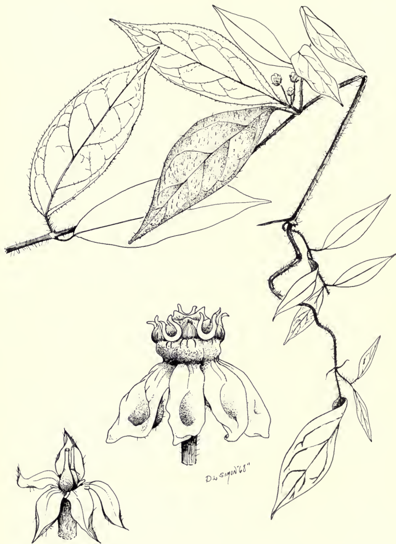
FIG. 1. Gonolobus donnellsmithianus . A, habit, \times \frac{1}{2} . B, flower in natural position showing petals, corona and gynostegium, \times 4 . C, calyx and ovaries (stigma removed), \times 5 .