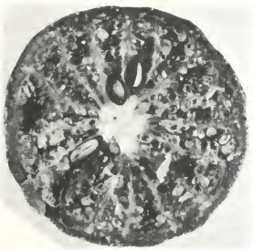
CLYMENIA POLYANDRA (Tanaka) Swingle