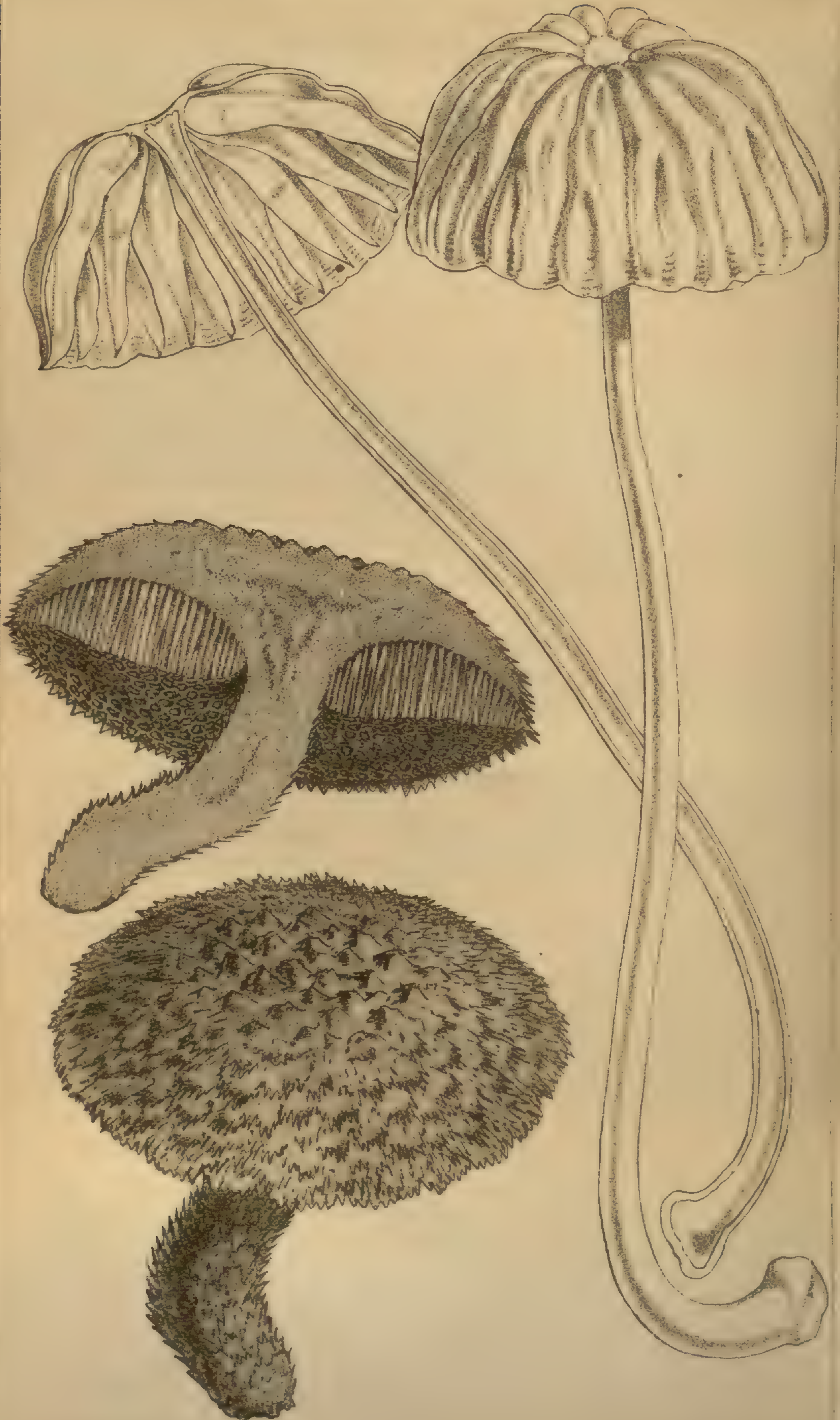
Strobilomyces nigricans , Berk. Marasmius Hookeri , Berk.